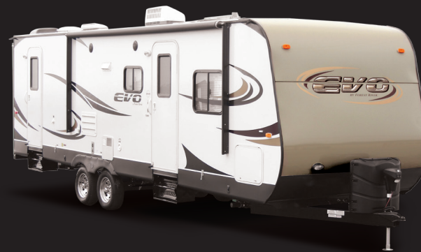
T2850 Shown w/ optional Fiberglass Exterior