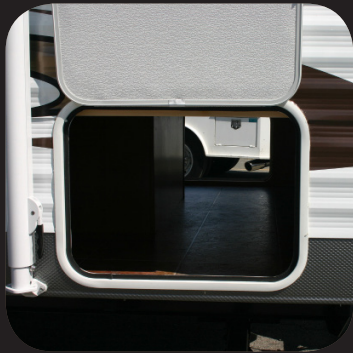
FULL PASS THROUGH STORAGE

HD LED TV 30# LP Bottles Alumina Wall Fiberglass Exterior BBQ Hook Up Black Tank Flush Chrome Wheels w/ Matching Spare Spare Tire w/ Carrier Ducted Air Conditioning 15k BTU Air Conditioner w/ Quick Cool Power Awning w/ Adjustable Legs Glass Shower Enclosure (per FP) Night Shades Outside Shower Power Tongue Jack Roof Ladder Skylight Over Tub Stainless Steel Package Storage Plus Door (T2550 Only) Stabilizer Jacks Deluxe Swivel Chairs (T2460) 160W Solar Kit Arctic Package -Insulated & Enclosed Tanks -12v Heat Strips -R7 Fiberglass Insulation Throughout -R-38 Radiant Foil (Roof and Floor) Tankless Water Heater