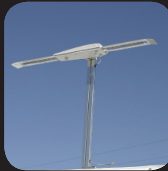
DIGITAL HD TV ANTENNA