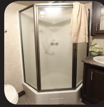
OPT GLASS SHOWER (PER FP)