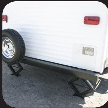
4 CORNER STABILIZER JACKS + MATCHING SPARE