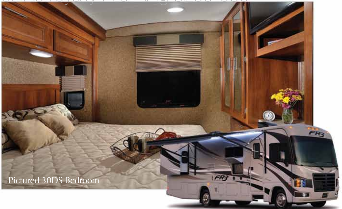
Pictured 30DS Bedroom