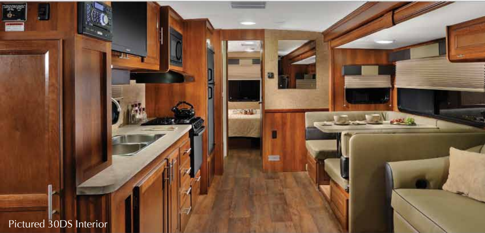
Pictured 30DS Interior