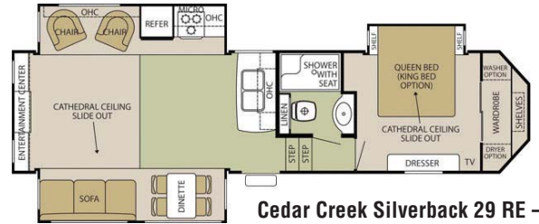
Cedar Creek Silverback 29 RE – Rear Entertainment