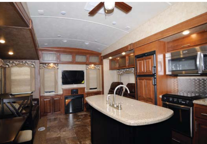
With a rear entertainment centre that can be outfitted with an optional fireplace, the Silverback is fully equipped for all your RV adventures.