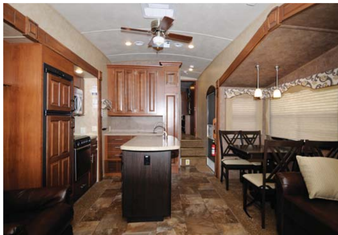
The facing slide-outs in the rear section of the trailer create a very spacious livingroom. The cathedral ceiling slide-outs are unique – headroom is excellent.