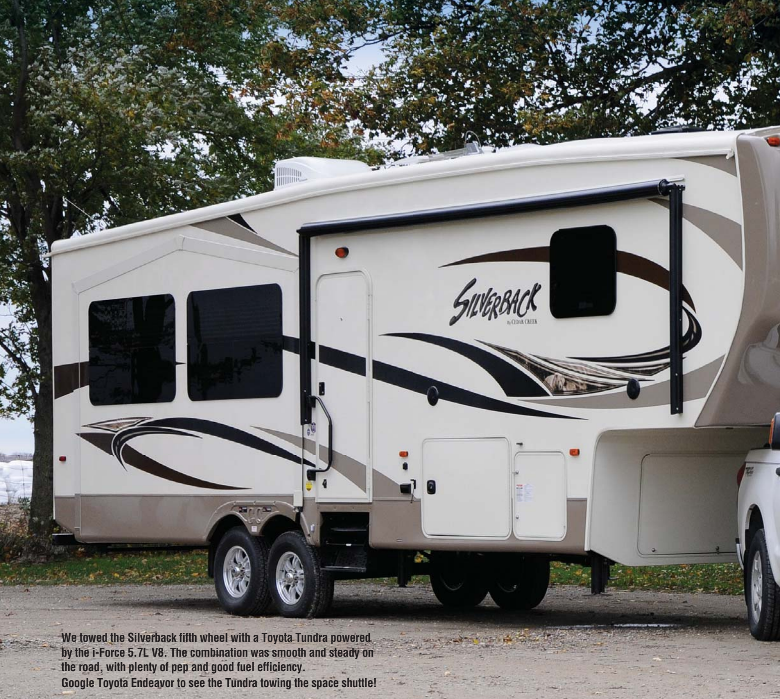
We towed the Silverback fifth wheel with a Toyota Tundra powered by the i-Force 5.7L V8. The combination was smooth and steady on the road, with plenty of pep and good fuel efficiency. Google Toyota Endeavor to see the Tundra towing the space shuttle!