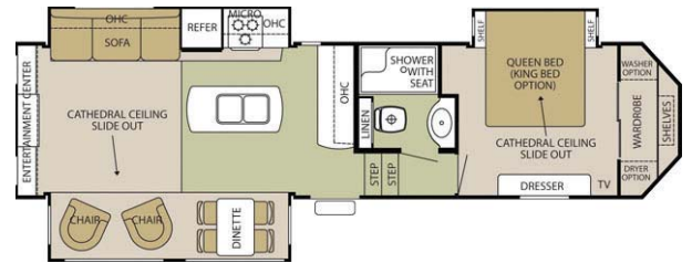
Cedar Creek 29 IK – Island Kitchen

All in all, an excellent choice for the family looking for a fifth wheel trailer that loves the road, and makes a wonderful home away from home in any campground. 🌟