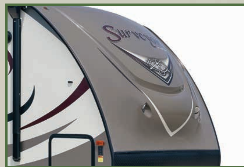
Front Gel Coat Fiberglass Cap (Travel Trailer)