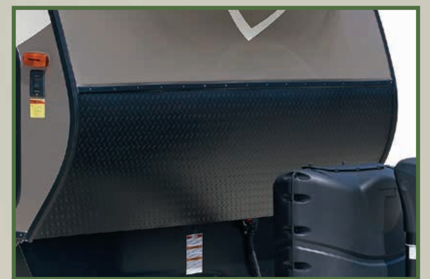
Black Diamond Plate (Travel Trailer)