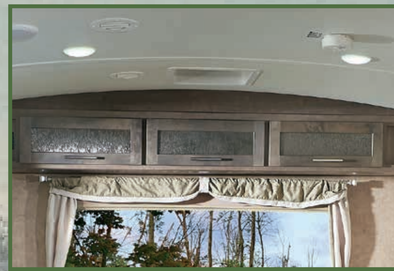
LED Recessed Interior Lighting