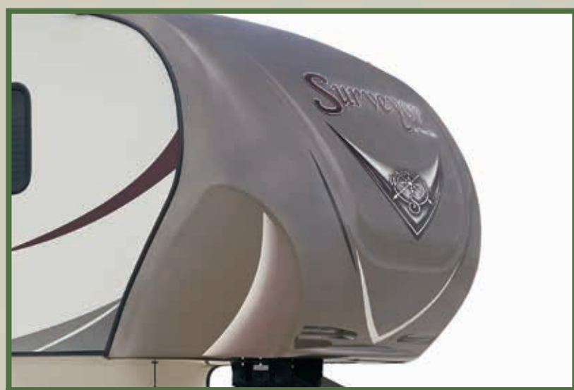
Front Gel Coat Fiberglass Cap (Fifth Wheel)