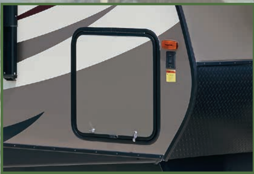
Magnetic Hinged Baggage Door Catches