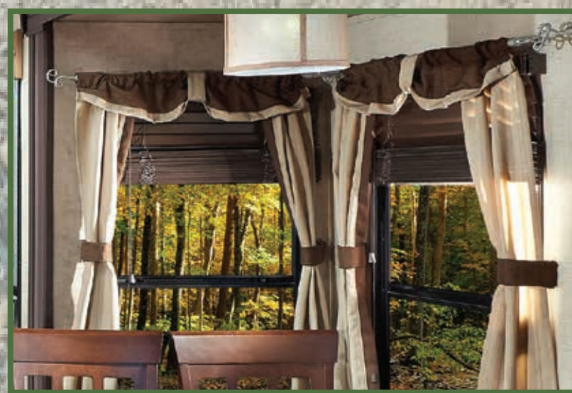
Living Room Wood Blinds