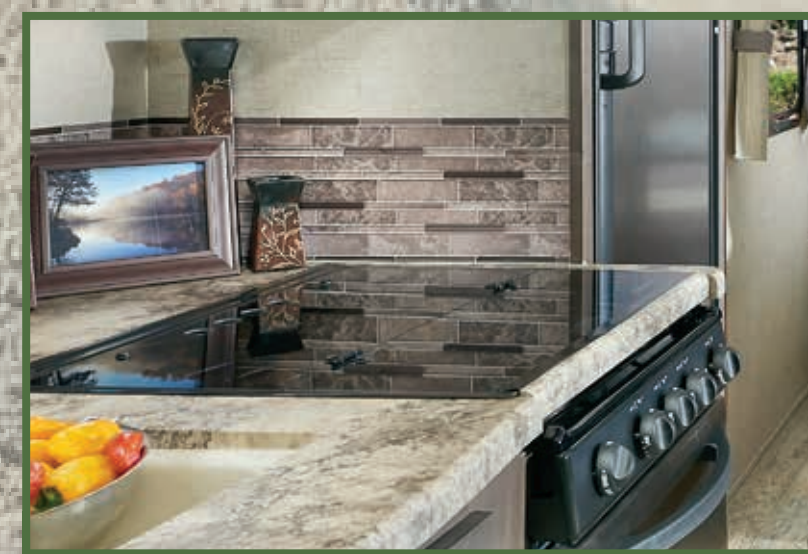
Recessed Stove with Glass Cover