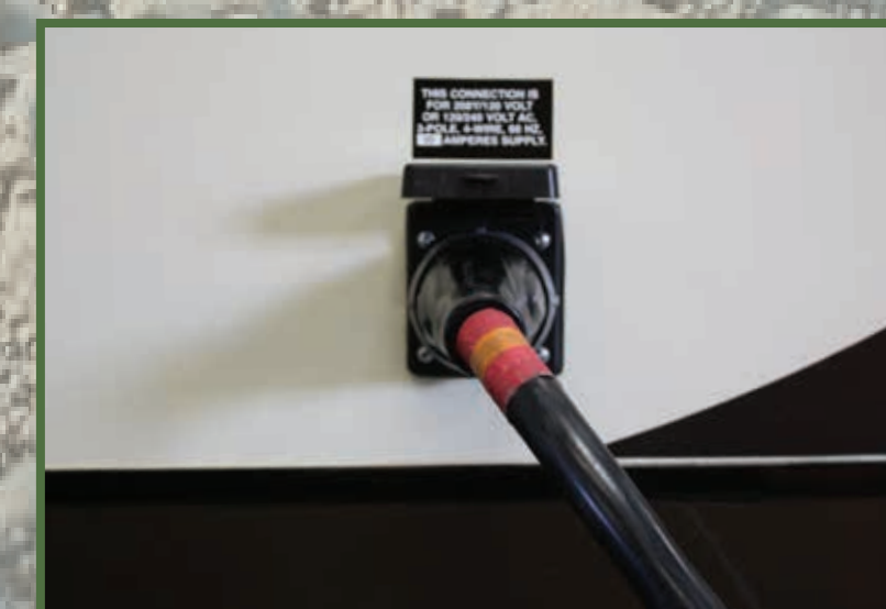
50 Amp Service (Standard Fifth Wheel/ Optional Travel Trailer)

To learn more about Surveyor RV SCAN HERE