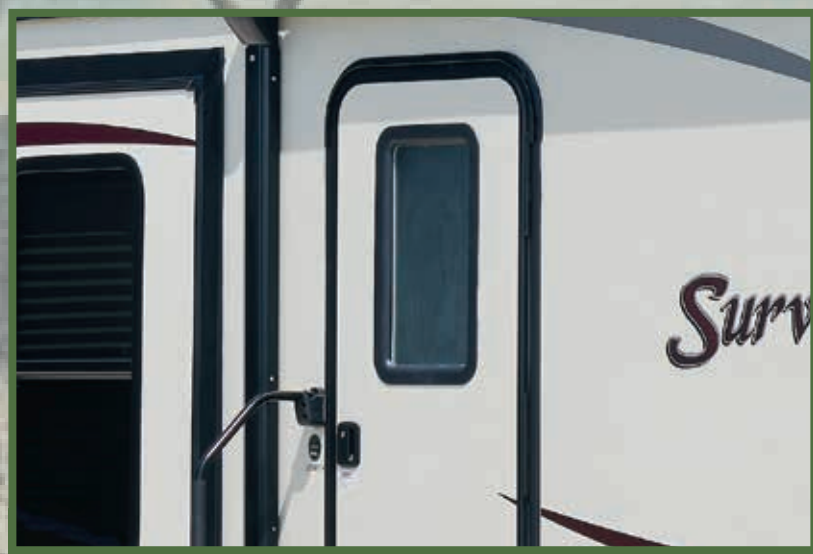
Friction Hinges on Entry Door