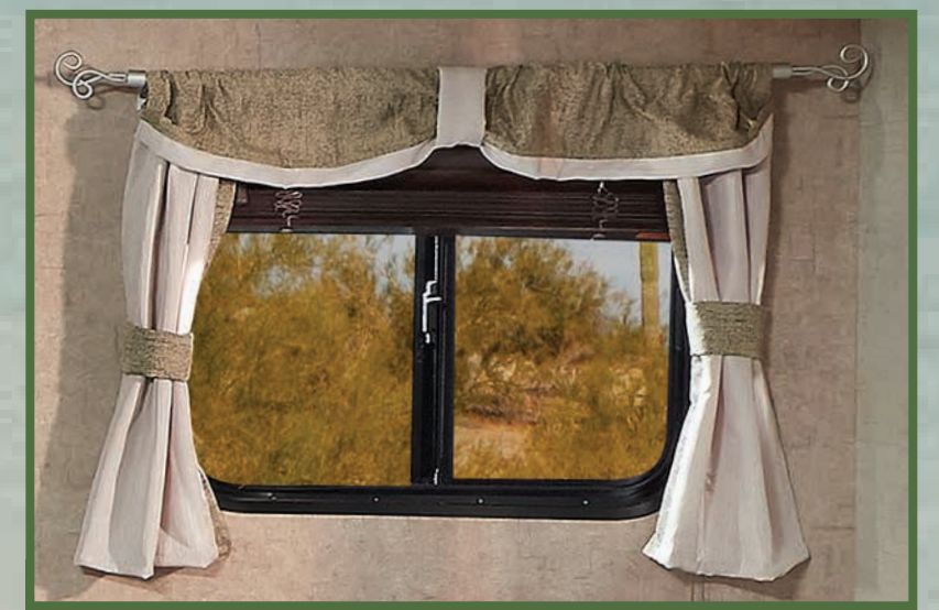
Residential Curtain Rods