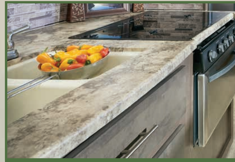
Seamless Countertops (Travel Trailer)