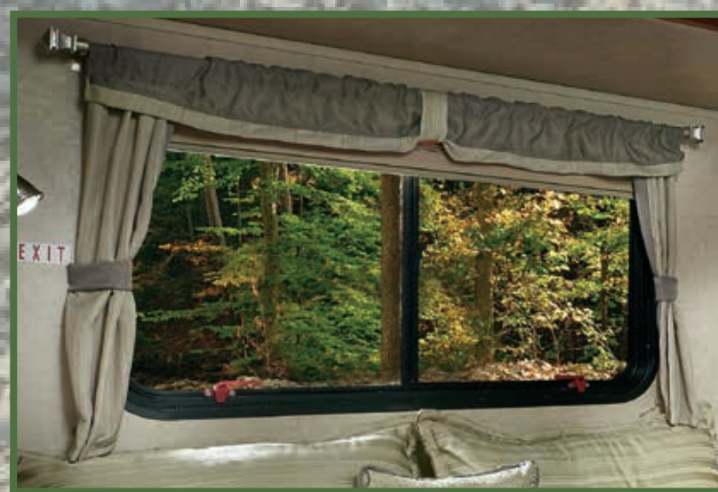
Bedroom Night Shades