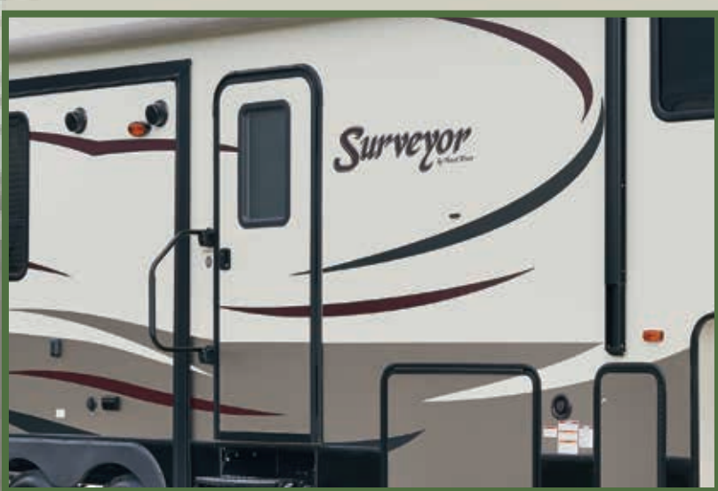
2-tone Gel-coated Fiberglass Side Walls with Premium Graphics