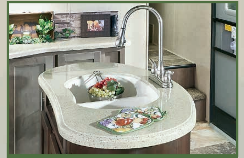
Solid Surface Countertops with Under Mounted Sink (Fifth Wheel)