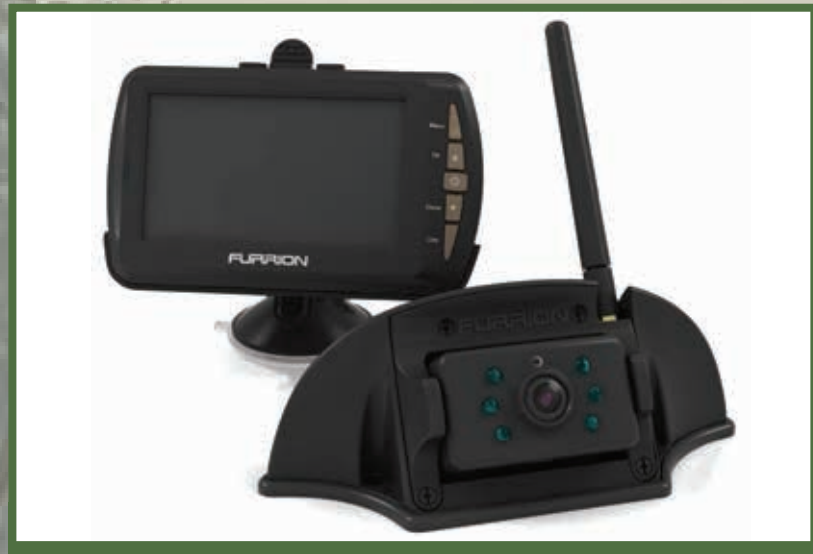
Back Up Camera (Prep Only Travel Trailer)