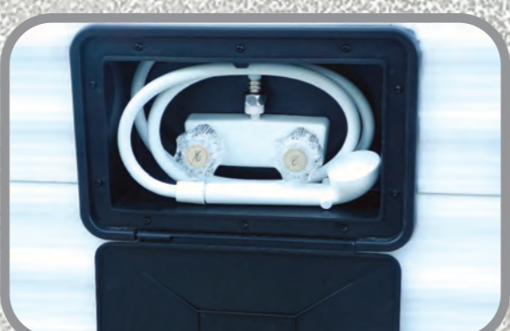
Exterior Shower with Hot and Cold Water