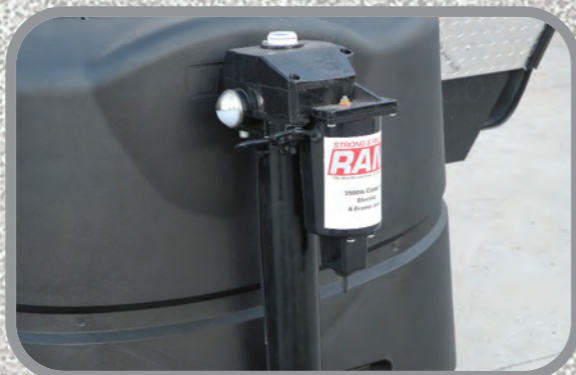
Power Tongue Jack