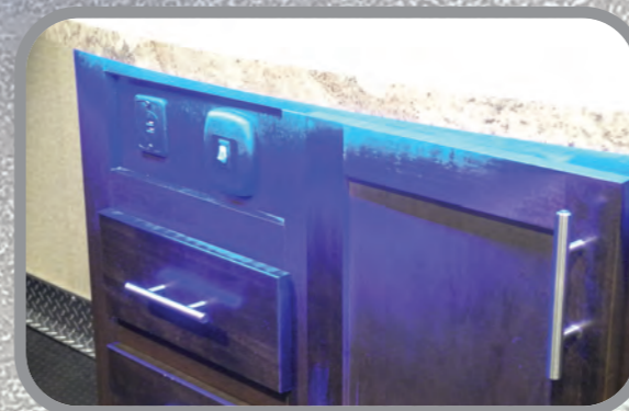
LED Accent Lighting