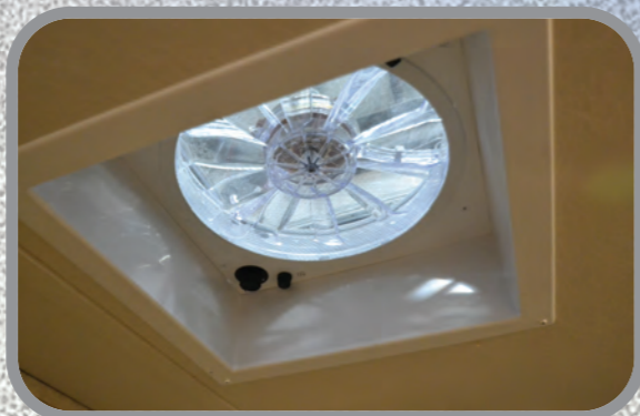
Fantastic Bath Ventilation Fan