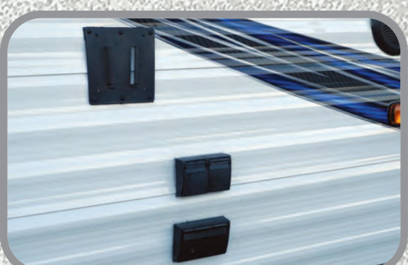
Outdoor TV Bracket and Hook-up