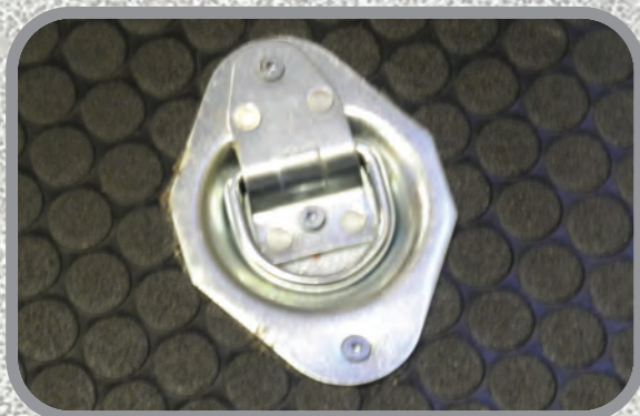
2500 Lb. Tie-downs