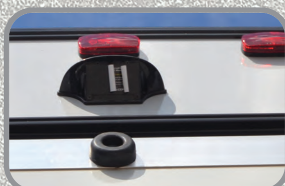
Back-up Camera Ready