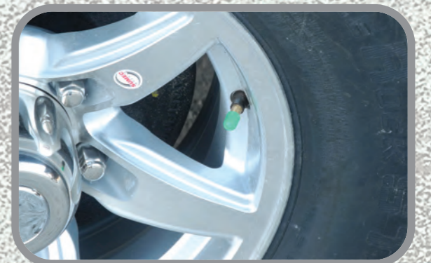
Nitrogen Filled Tires with Aluminum Rims