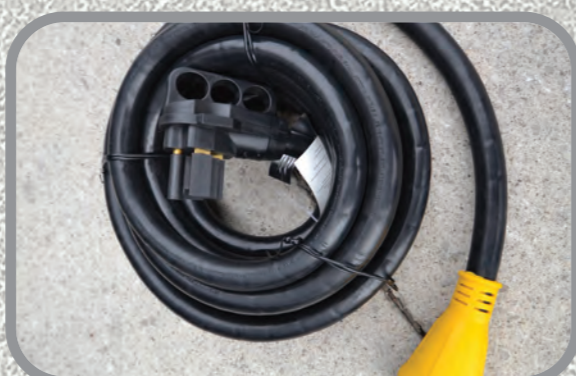
50 Amp Service with Detachable Cord (FW)