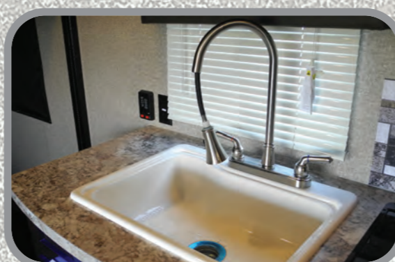
Pull-out High Rise Kitchen Faucet