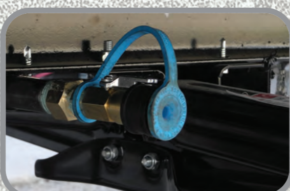
Outdoor Grill Quick Disconnect