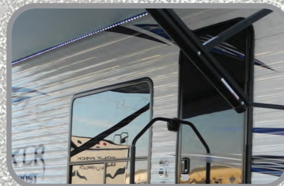
Adjustable Power Awning with LED Lights