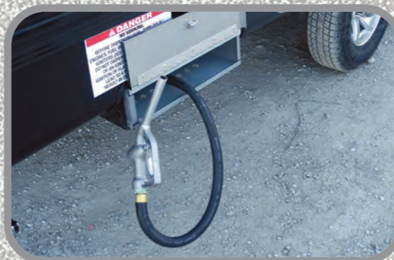
30 Gallon Fuel Station