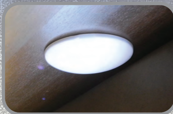
Energy Saving LED Interior Lights