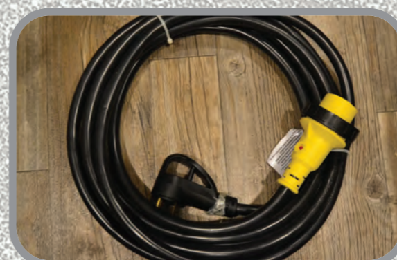
30 Amp Service with Detachable Cord (TT)