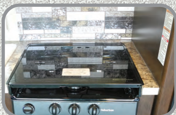
Convection Microwave and 3-Burner Cooktop