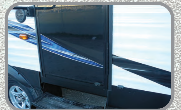
Friction Hinged Entry Door