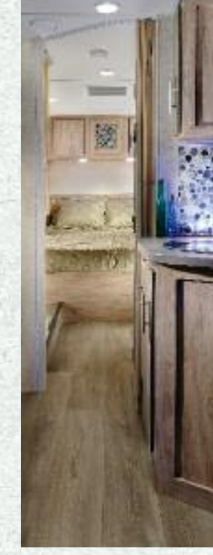
Forester TS offers a contemporary, light weight design that's not light on storage and amenities! The TV conveniently stows away when not in use.