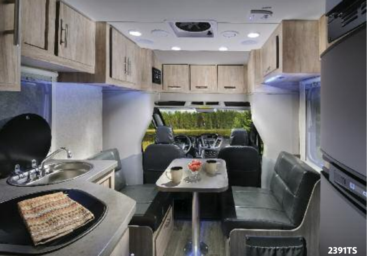
The ultra-light Forester TS is engineered for fuel efficiency with eco-friendly building materials. These lightweight, Poplar cabinets are certified to be sustainably sourced from European forests.