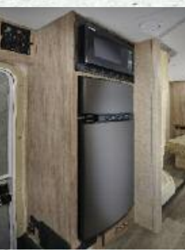
5.3 Cu. ft Eurostyle Refrigerator operates on 12V/110/LP