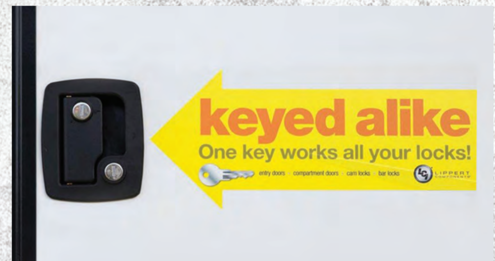
Keyed Alike Single Lock System