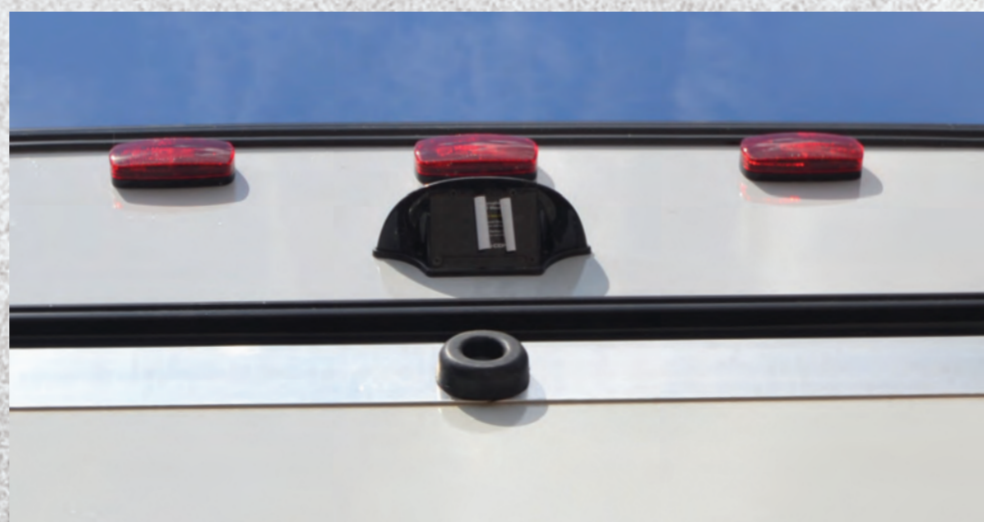
Rear Vision Camera Pre-wire