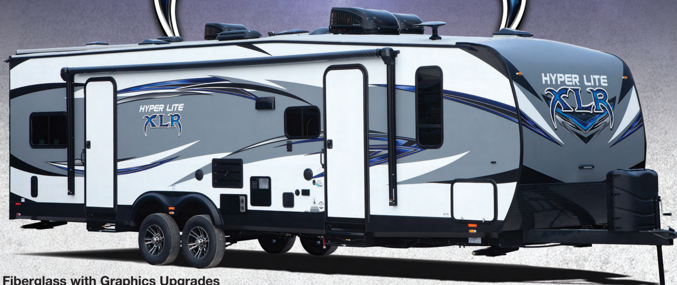
Two-tone Diamond White and Aztec Grey Fiberglass with Graphics Upgrades