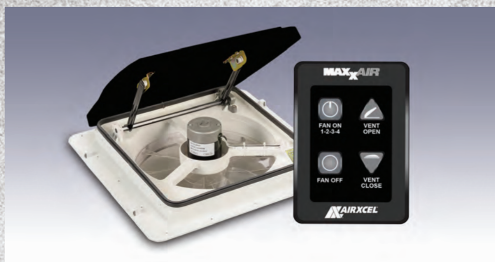
MaxxAir Power Roof Vent in Bathroom