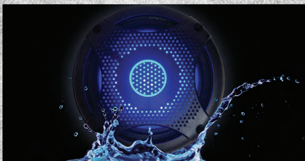
Neo-Blue Exterior Marine Grade Speakers