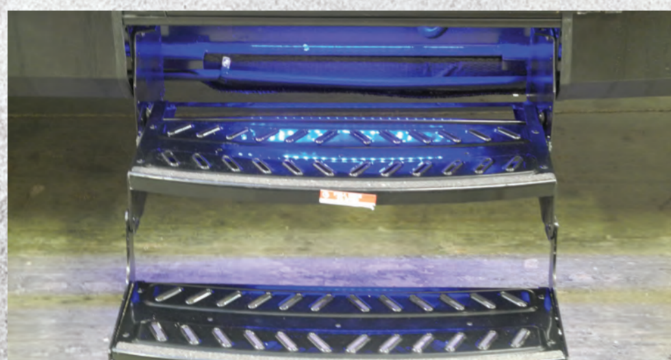
Neo Blue Light Under Entry Steps