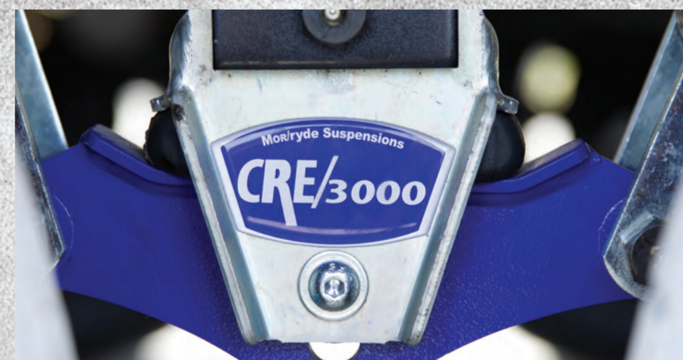
MORyde CRE Suspension Enhancement

Not all models in dealer inventory will be equipped with this package. See dealer for details.