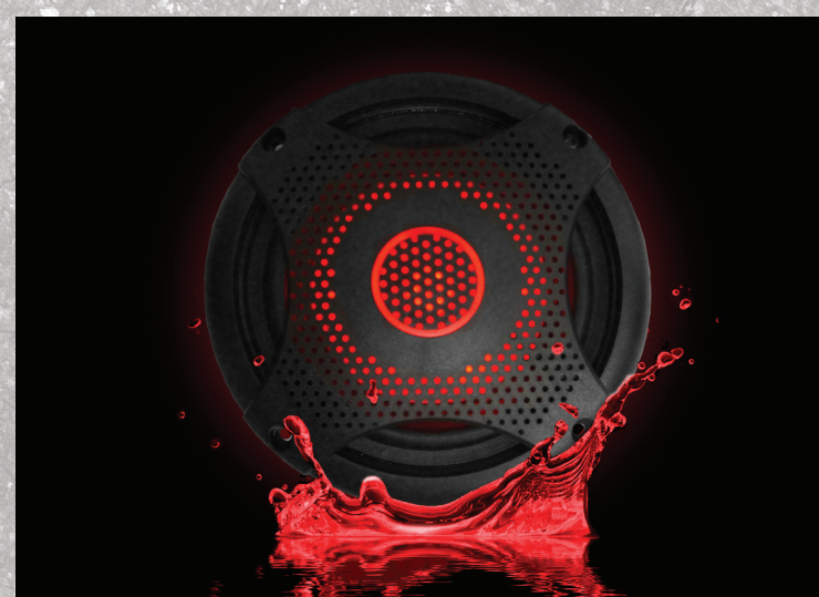
RED LED Exterior Marine Grade Speakers