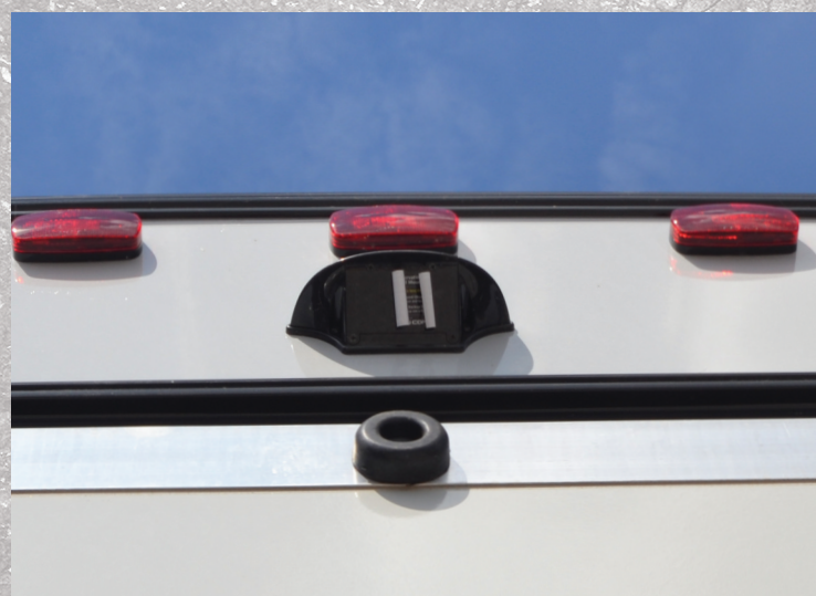
Rear Vision Camera Pre-wire