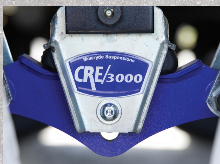
MORryde CRE Suspension Enhancement System