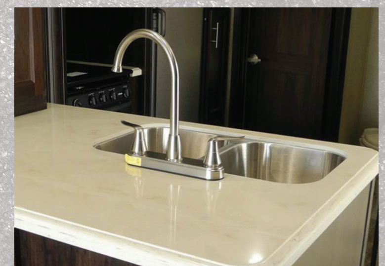
LG Solid Surface Kitchen Countertop

Not all models in dealer inventory will be equipped with this package. See dealer for details.