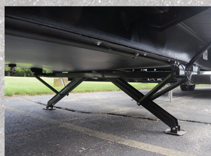
Electric Stabilizer Jacks