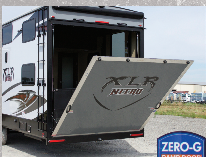
MORryde Zero G Ramp Door