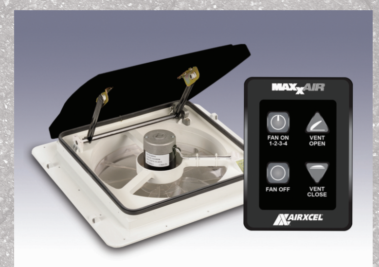
MaxxAir Power Roof Vent Bathroom