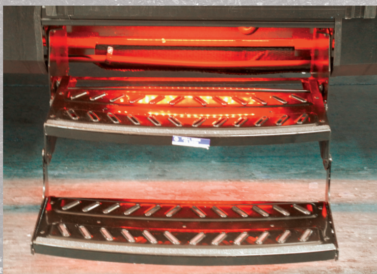
N.O.S. Red Light Under Entry Steps