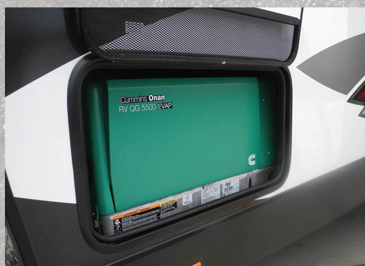
Large Generator Box (Generator not included)