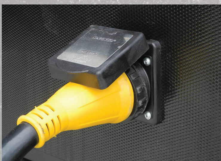
50 AMP Service