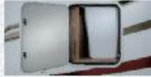
Easy exterior trash access