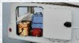
Pass through storage