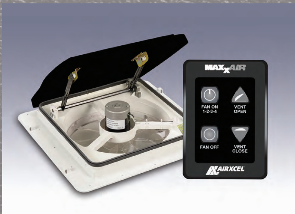
MaxxAir Power Roof Vent in Bathroom