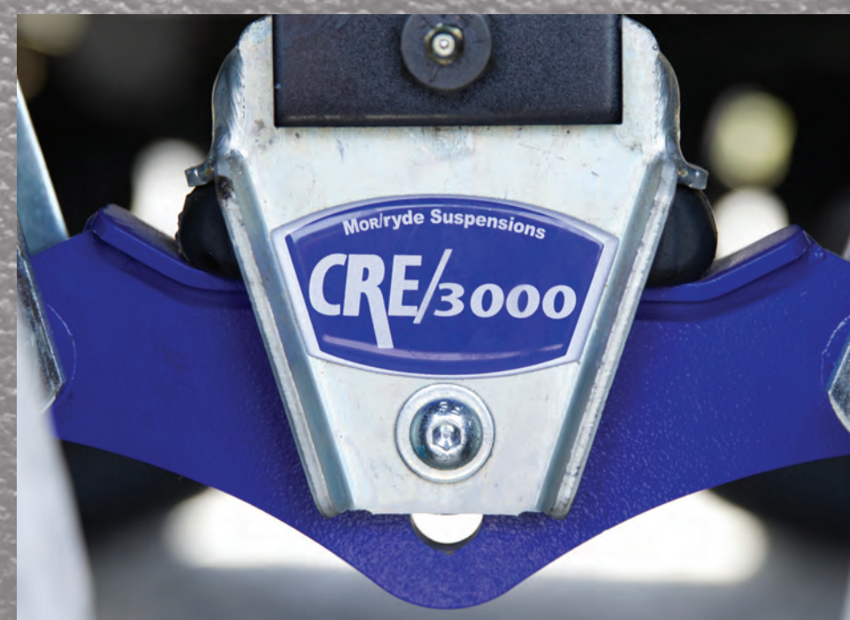
MORryde CRE Suspension Enhancement System