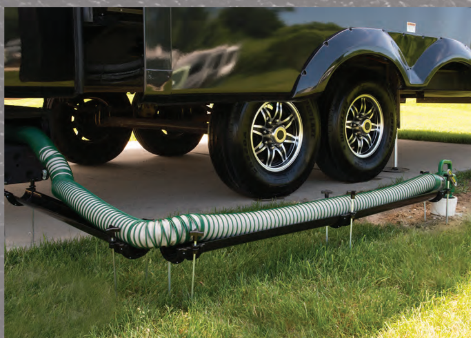
Waste Master RV Sewer Management System