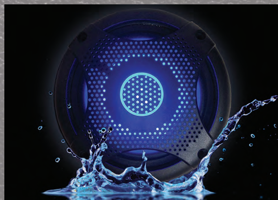
Neo-Blue Exterior Marine Grade Speakers

Not all models in dealer inventory will be equipped with this package. See dealer for details.