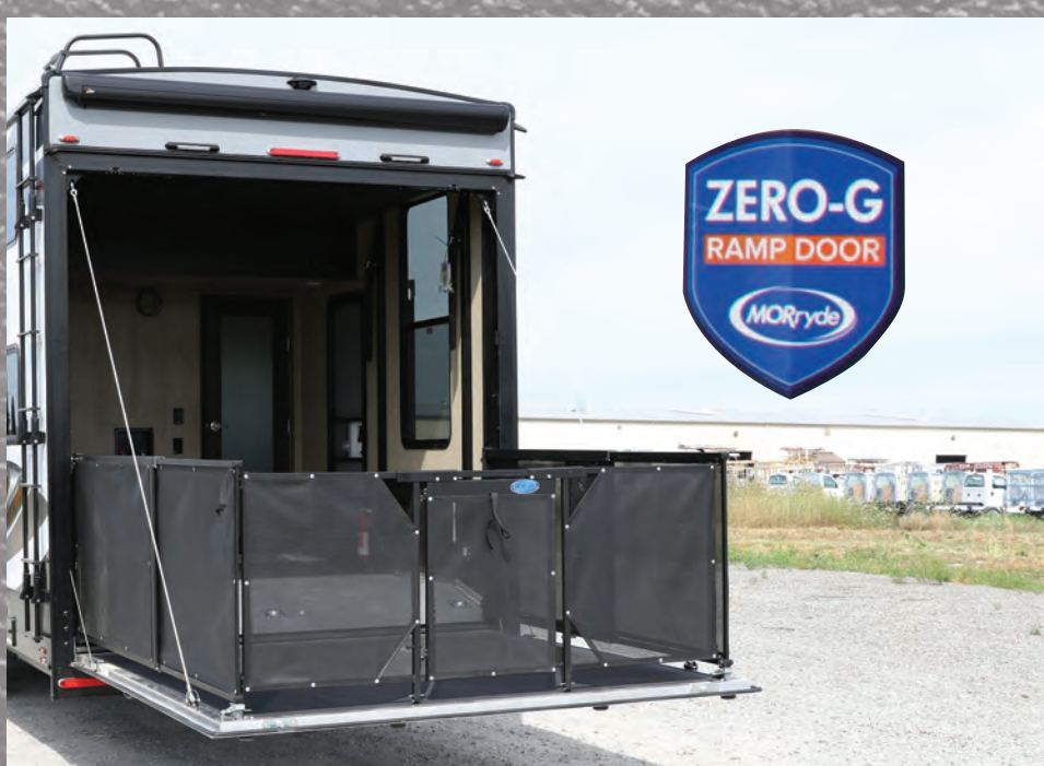
MORryde Zero G Ramp Door and VIP Deck with Electric Awning