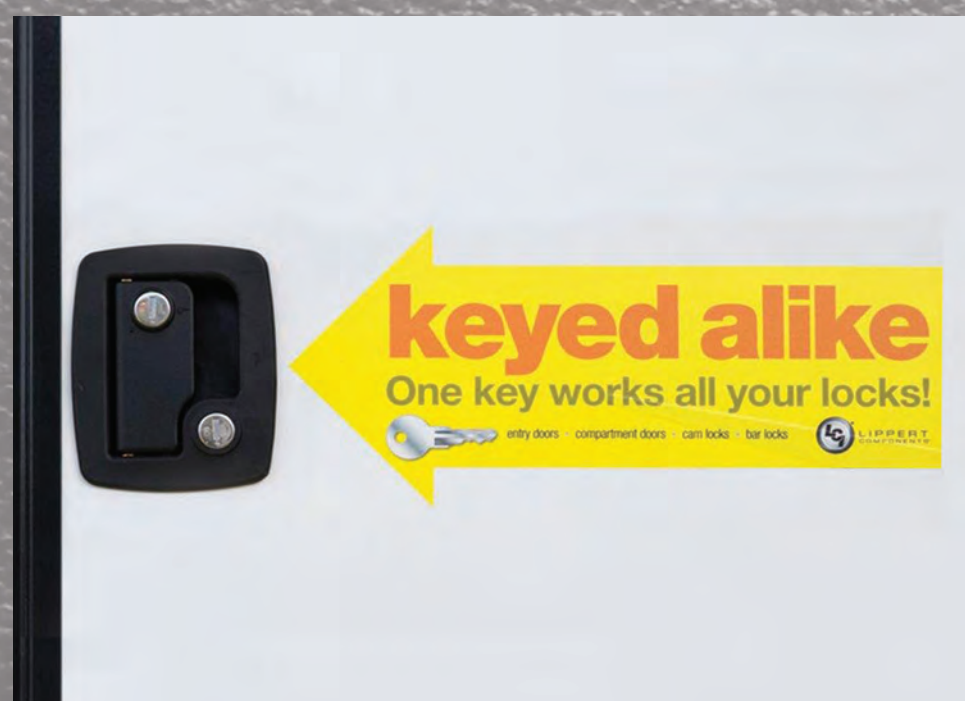
Keyed Alike – Single Key Lock System