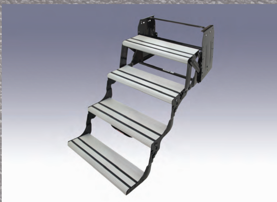
Alumi-Tread Entry Steps