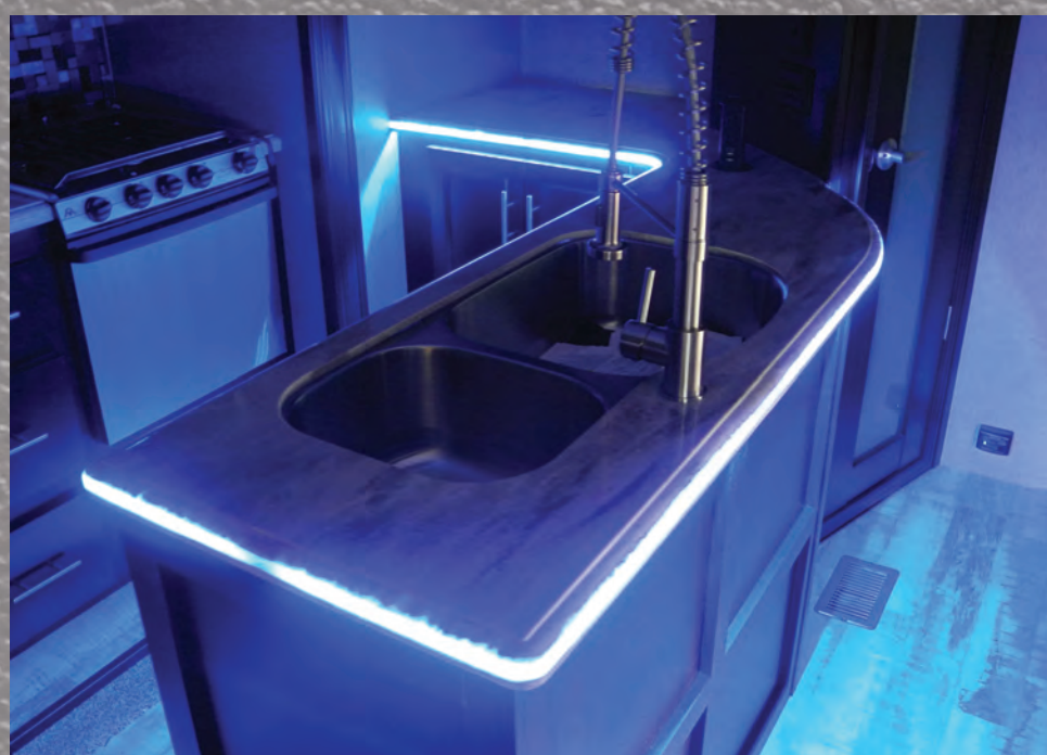
LED Lighted Galley Countertops