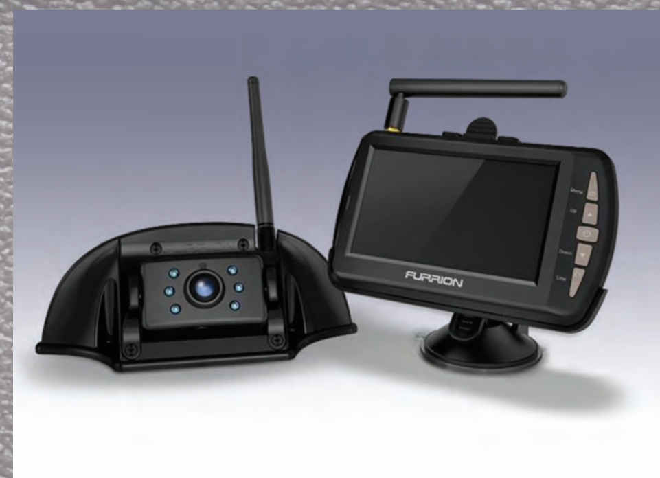
Rear Vision Observation Camera