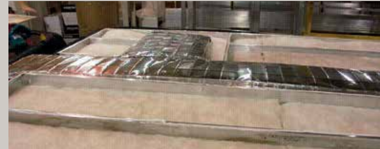
2" x 3" Aluminum floor studs