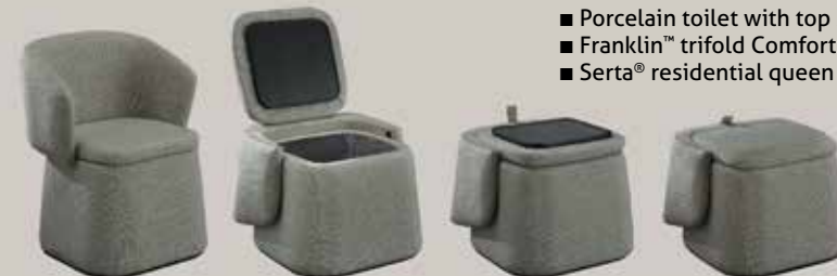
OPTIONAL MULTI-FUNCTION CHOTTOMAN

Is it an ottoman or a chair? You decide.