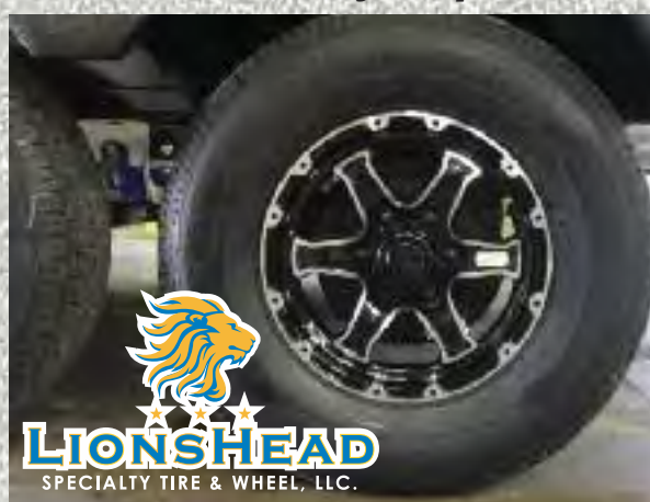
Aluminum Wheels, Radial Tires with Nitrofill and No Fuss Warranty, Full Sized Spare Tire