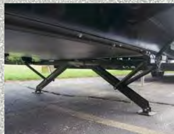
Electric Stabilizer Jacks