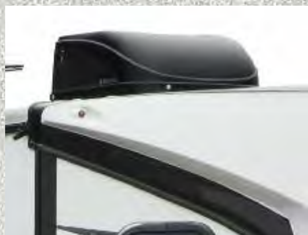
15,000 BTU Ducted Roof A/C