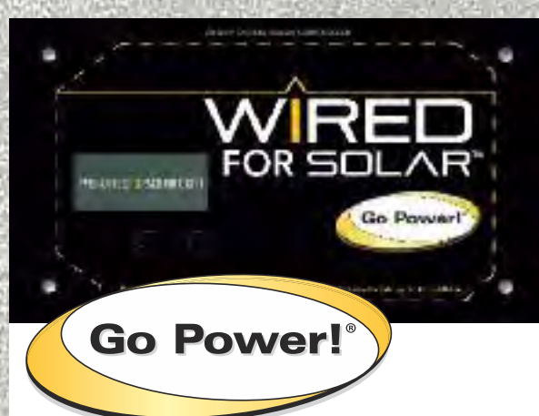
Solar Roof Prep