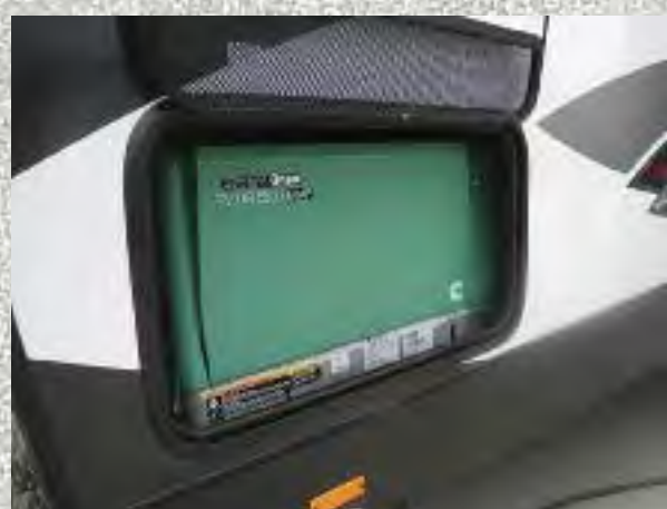
Generator Prep (Generator not included)

UP TO $10,149 RETAIL VALUE OF FREE UPGRADES!