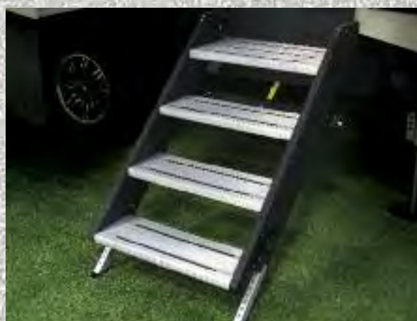
Upgraded Quad Main Entry Steps