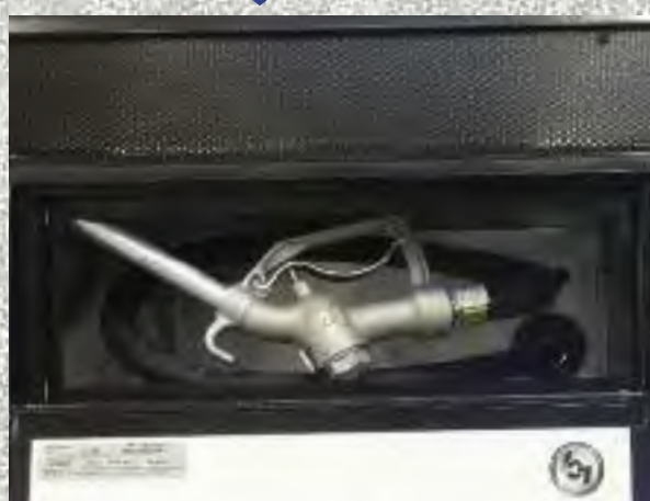
Mobile Fuel Station