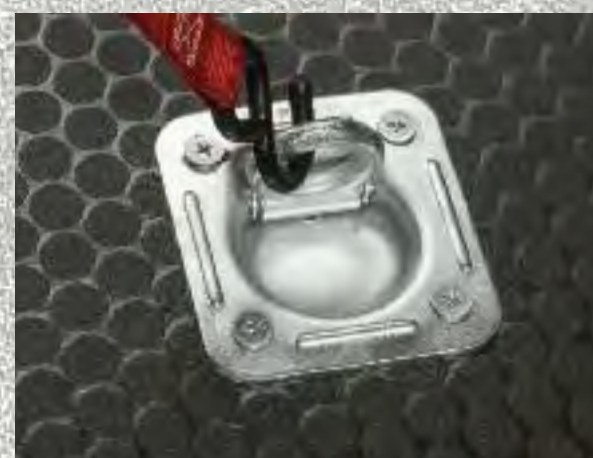
5,000 Lb. Rated Cargo D-rings