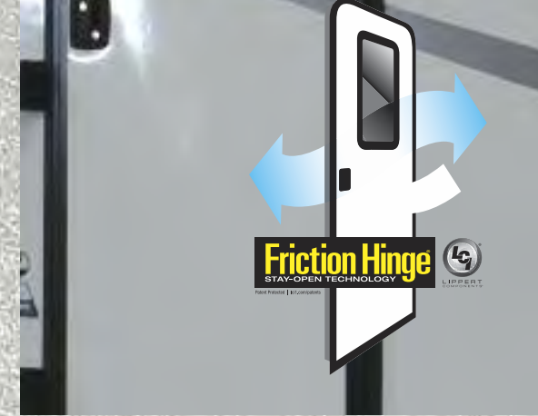
Main Entry Door with Friction Hinge