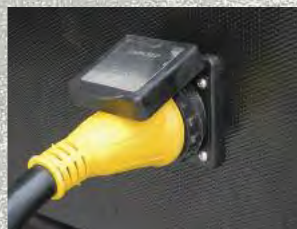
50 AMP Service with Transfer Switch