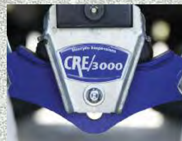
MORryde CRE 3000 Suspension Enhancement System