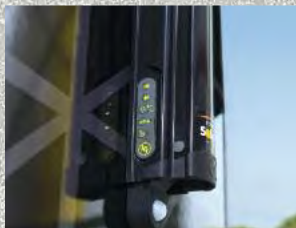
Electric Awning with LED Lights