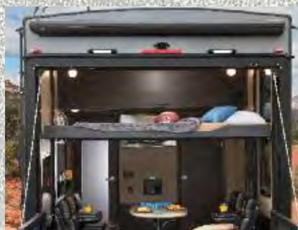
Single Electric Bed with Max Clearance Pass Thru Dinette