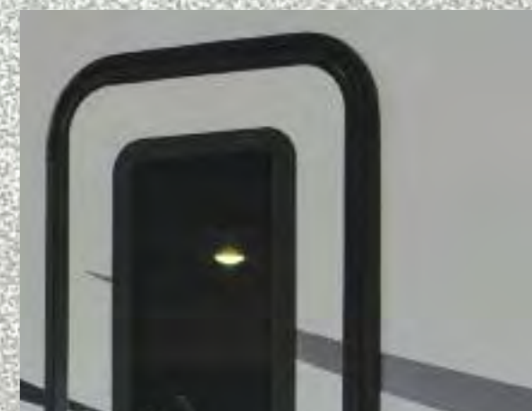
Main Entry Door with Friction Hinge