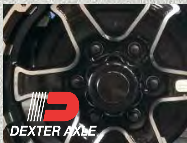
E-Z Lube® and Nev-R-Adjust® Axles