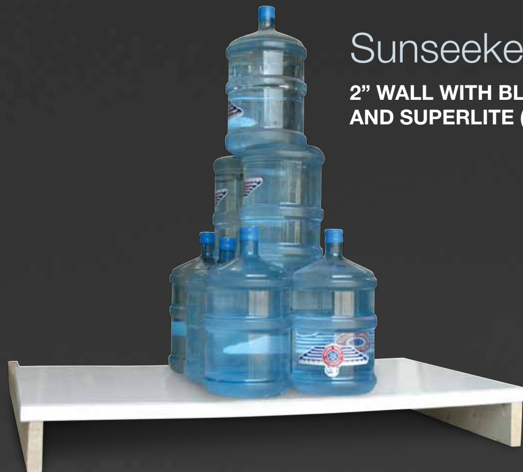
Sunseeker 2" WALL WITH BLOCK FOAM AND SUPERLITE (R-10)

Structural integrity is not compromised at Sunseeker! Sunseeker's fully laminated walls are visibly stronger and more durable.