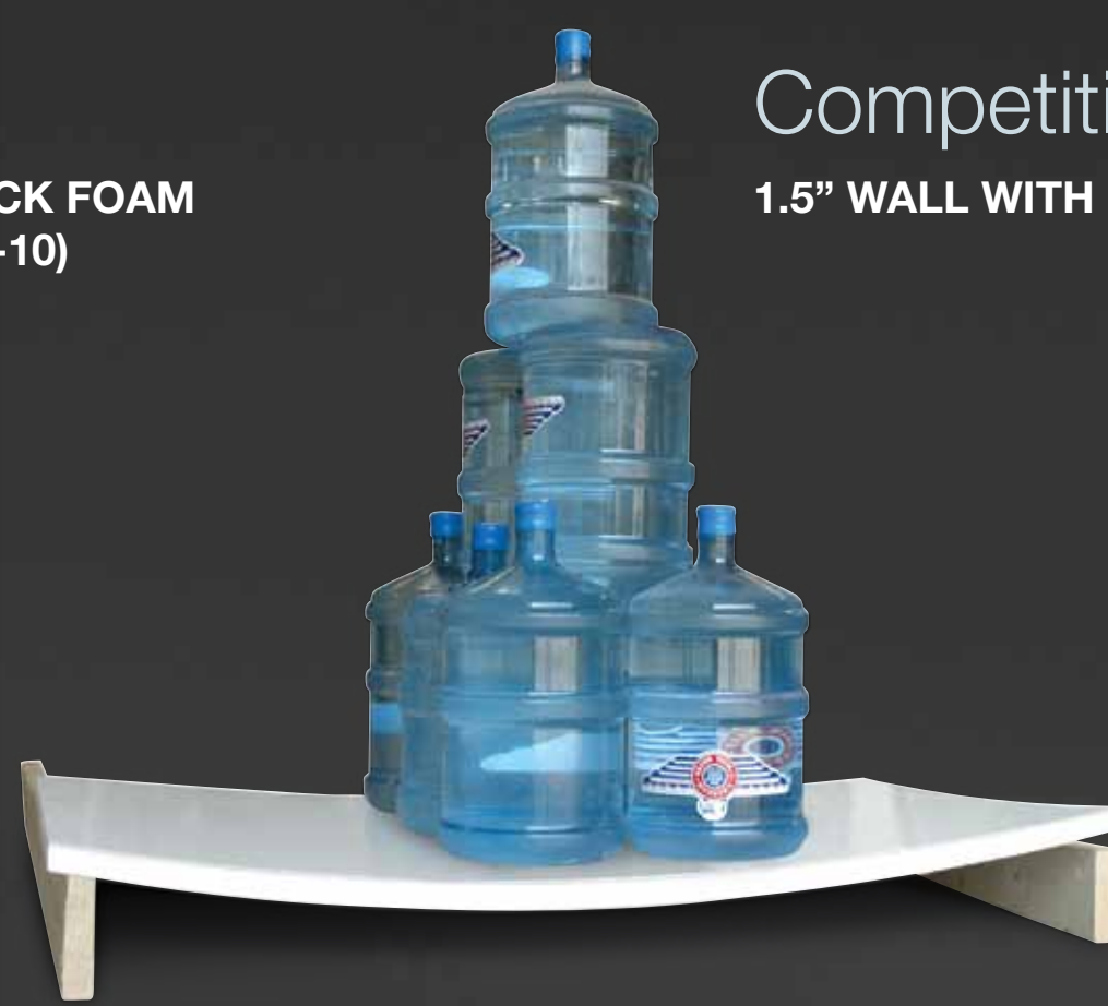
Competition 1.5" WALL WITH LUAN (R-6)

Structural integrity is not compromised at Sunseeker! Sunseeker's fully laminated walls are visibly stronger and more durable.