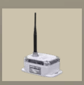
WiFi Ranger Signal Booster