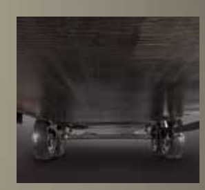
Fully Enclosed and Heated Underbelly