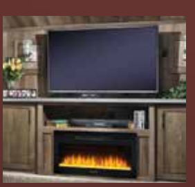
LED TV and Electric Fireplace