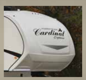
Gel Coat Fiberglass Front Cap