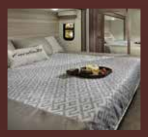
72" X 80"King Bed