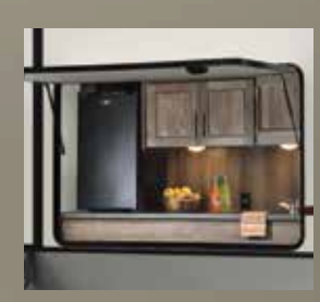
Large Exterior Camp Kitchen (Most Models)