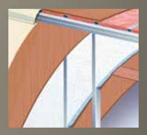
2" Laminated, Vacuum Bonded Walls and Floors