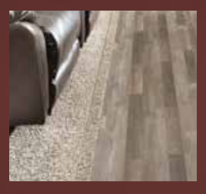
Shaw® Carpet and Linoleum