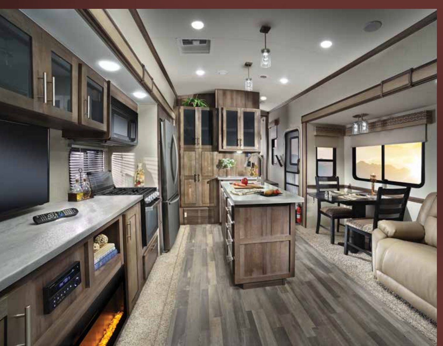
A WINDOW BEHIND THE STOVE OF THE 383BH HELPS OPEN UP THE LARGE KITCHEN/LIVING AREA. THIS UNIT ALSO FEATURES A LARGE ENTERTAINMENT CENTER, DOUBLE BOWL SINK, SPACIOUS WALL PANTRY AND PROVIDES AN OPEN FLOW TO THE REAR BUNKROOM. (Shown with Champagne Decor)