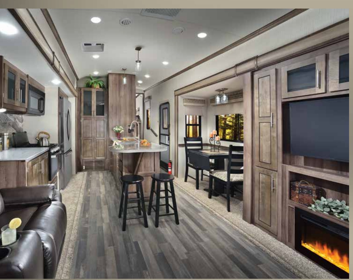
THE 322DS FEATURES A LARGE OPEN KITCHEN AREA WITH FREE STANDING DINETTE, 2 BAR STOOLS, UNDER COUNTER STORAGE AREA AND LARGE WALL PANTRY. (Shown with Cognac Decor)

THE EXPLORER KITCHEN HAS LG® SOLID SURFACE COUNTERTOPS AND A BAMBOO SINK COVER.