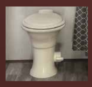
Porcelain Toilet with Foot Flush