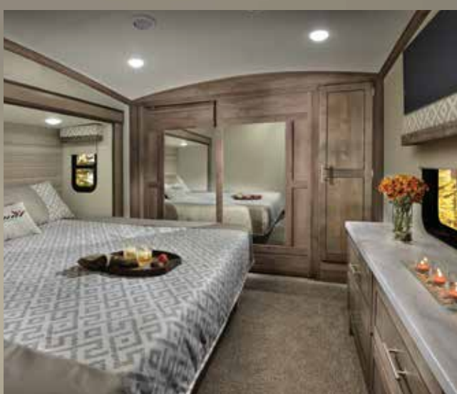
MASTER BEDROOM WITH 72" X 80" KING BED, STACKABLE WASHER/DRYER PREP AND LARGE DRESSER WITH DRAWERS. (Shown with optional TV)