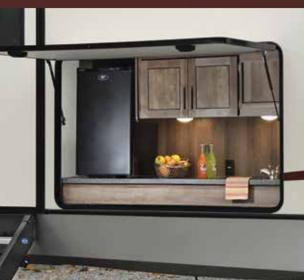
THE EXTERIOR KITCHEN FEATURES A 3 CU. FT. REFER, SINK WITH FAUCET AND AMPLE OVERHEAD STORAGE.