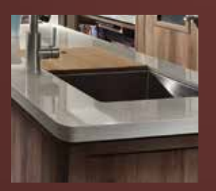
LG® Solid Surface Kitchen Countertops and Double Bowl Sink