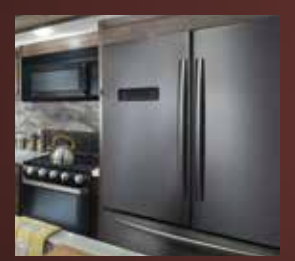
20.3 cu. ft. Residential Refridgerator