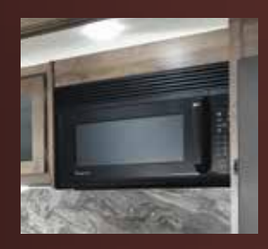
Magic Chef® 30" Residential Microwave