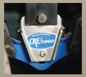
MORryde® CRE 3000 Suspension