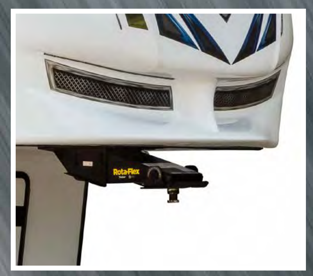
Trail Air Hitch Pin