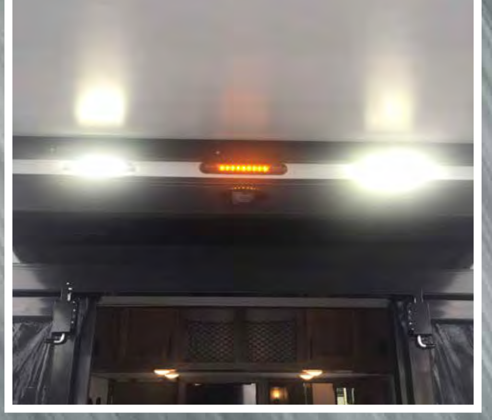
LED Rear Loading Lights