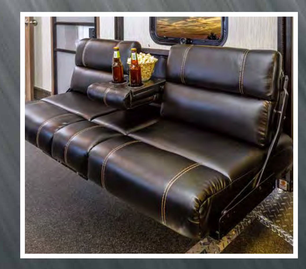
Upgraded Hinged HappiJac Sofas with Fold Down Cup Holder