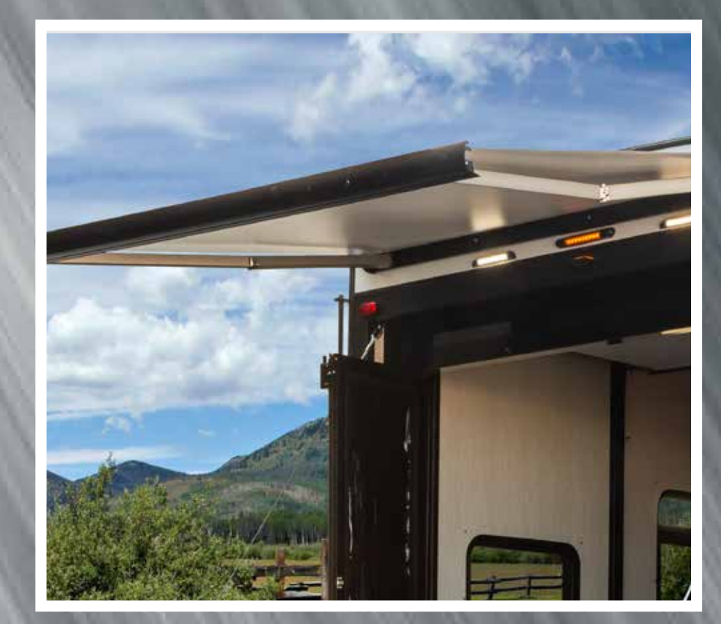
Ramp Patio Awning