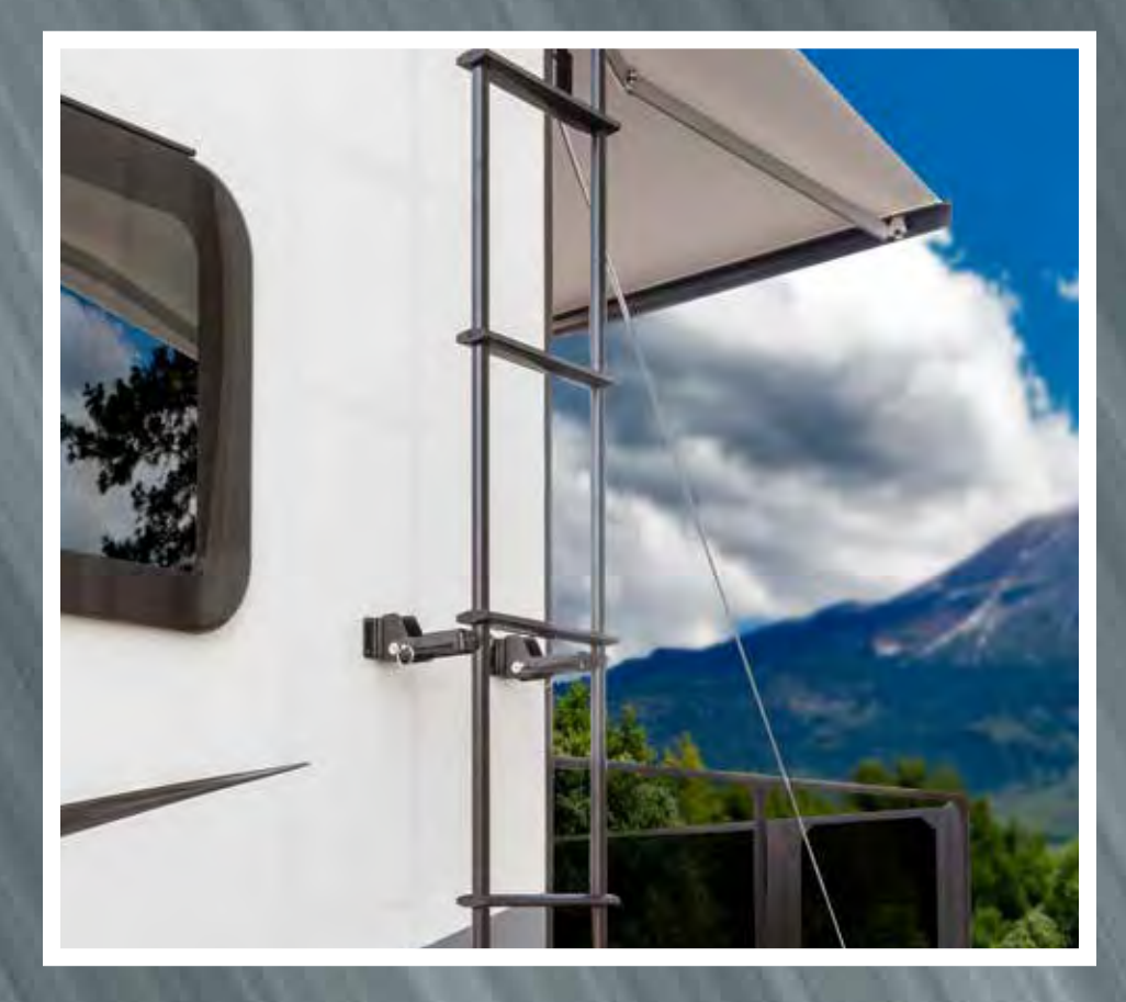
Collapsible Roof Ladder