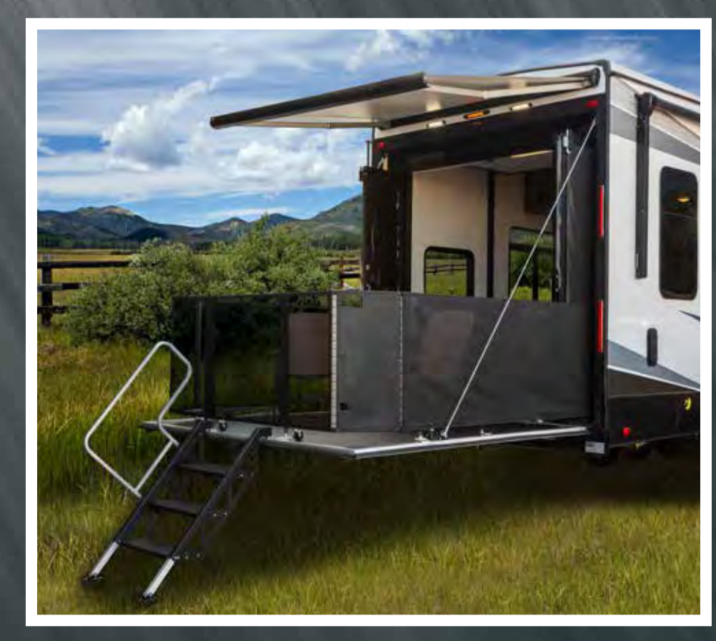
Upgraded Ramp Patio System