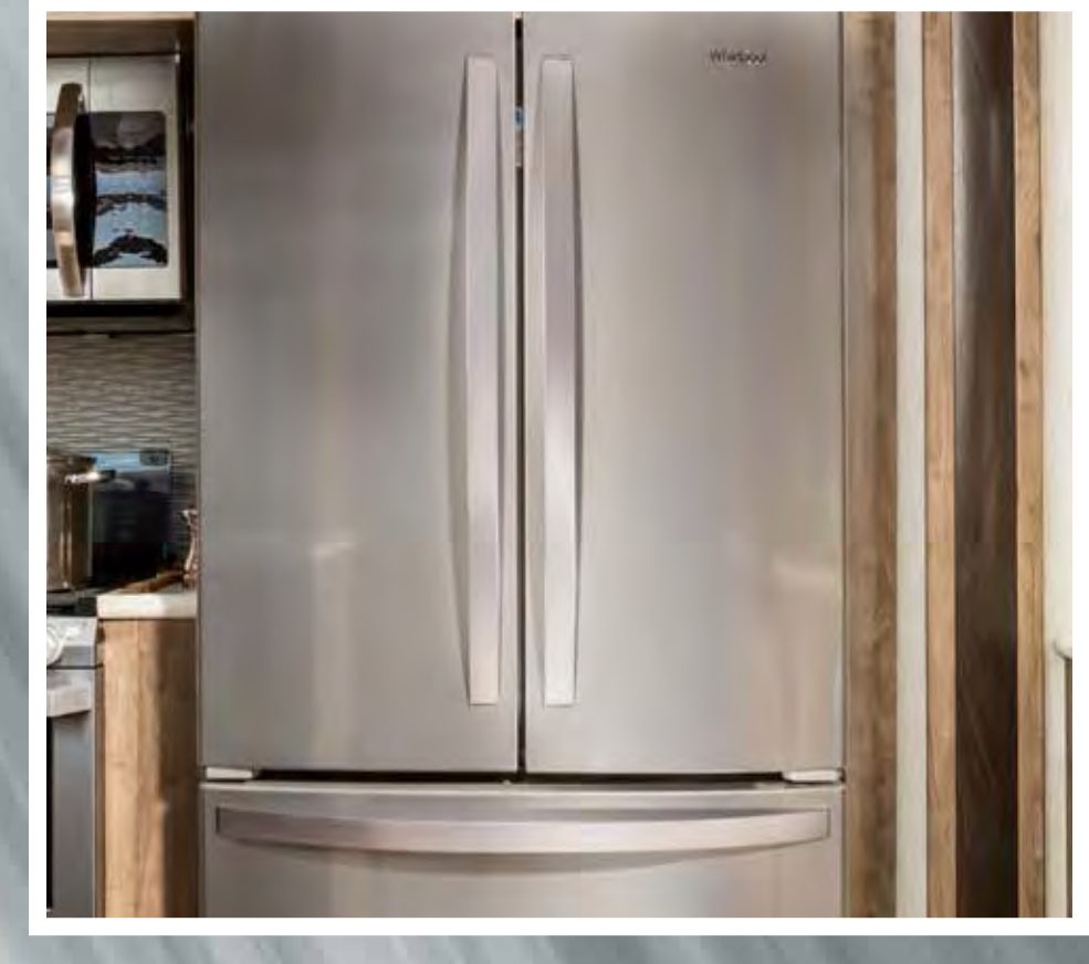
20 Cubic Foot Residential Refer w/Inverter