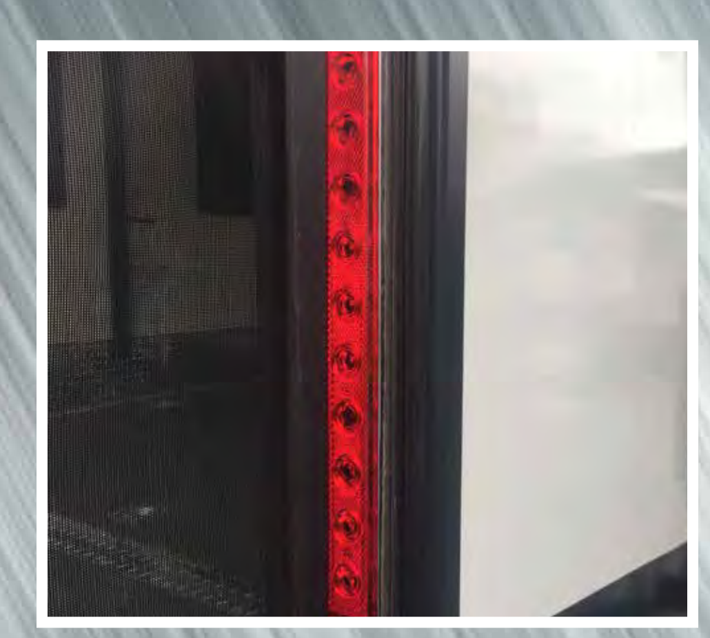
Quad LED Brake Lights