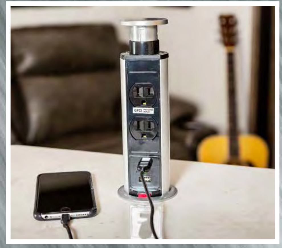
Multiple USB Charging Ports