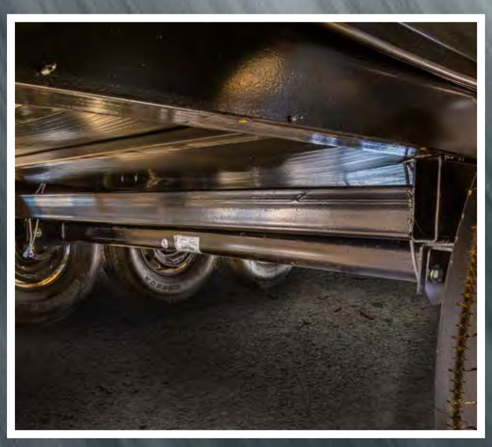
Upgraded 7000# Torsion Axles