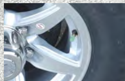
Nitrogen Filled Tires with Aluminum Rims