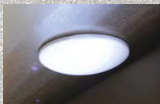
Energy Saving LED Interior Lights