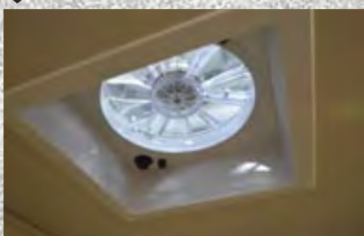
Fantastic Bath Ventilation Fan