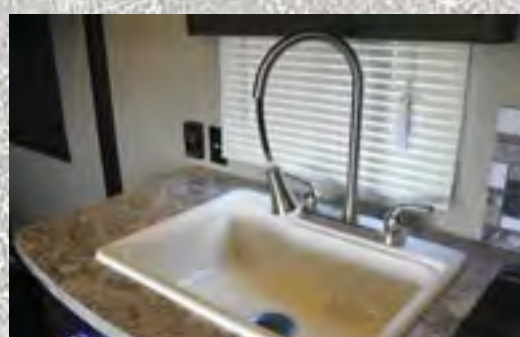
Pull-out High Rise Kitchen Faucet