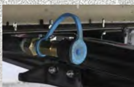
Outdoor Grill Quick Disconnect