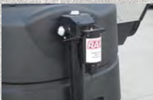
Power Tongue Jack