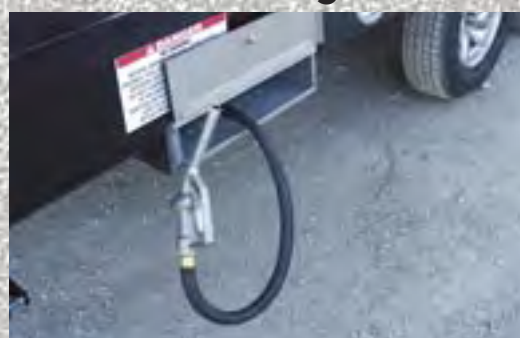
30 Gallon Fuel Station