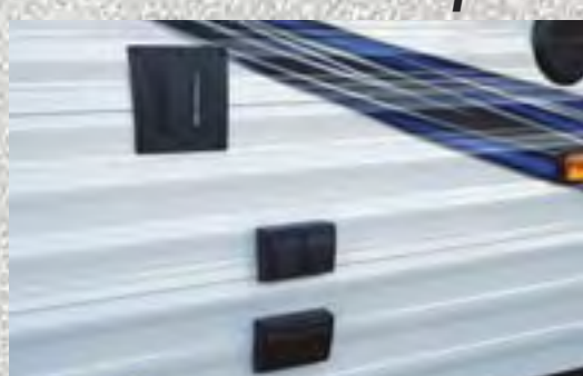
Outdoor TV Bracket and Hook-up