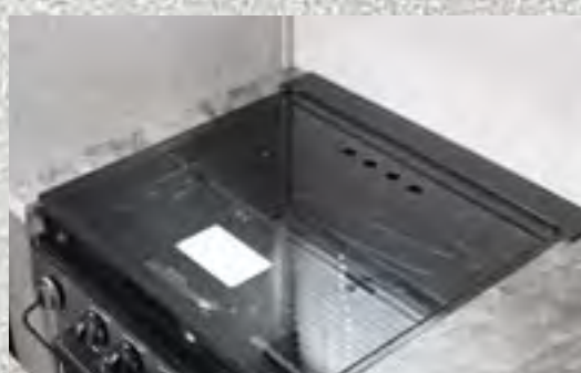
Convection Microwave and 3-Burner Cooktop