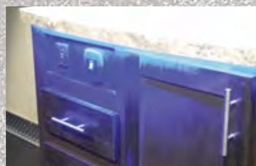
LED Accent Lighting