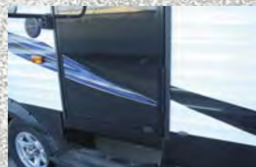
Friction Hinged Entry Door