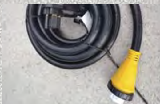
50 Amp Service with Detachable Cord (FW)