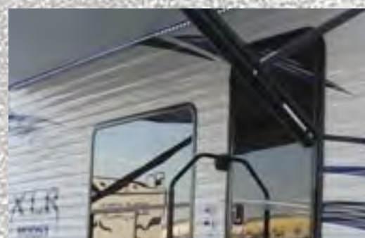
Adjustable Power Awning with LED Lights