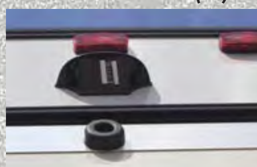
Back-up Camera Ready