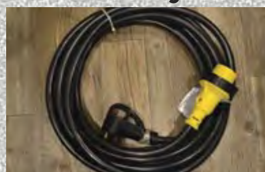
30 Amp Service with Detachable Cord (TT)