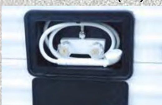
Exterior Shower with Hot and Cold Water