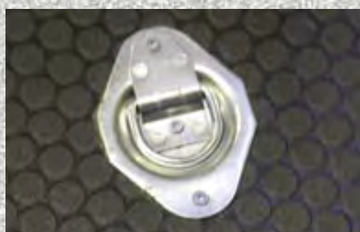
2500 Lb. Tie-downs

UP TO $3,625 RETAIL VALUE OF FREE UPGRADES!