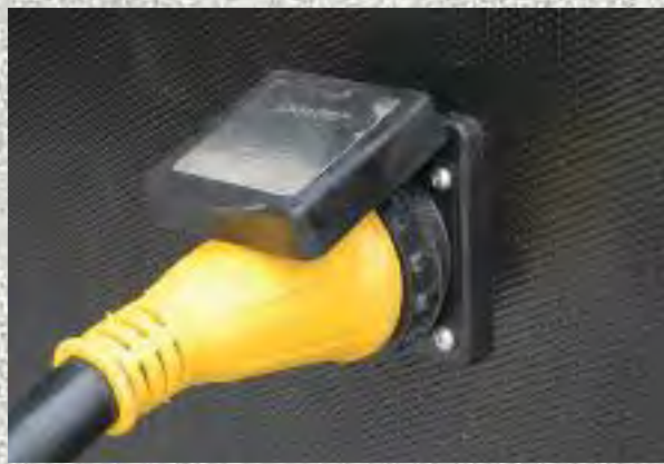
50 AMP Service with Transfer Switch