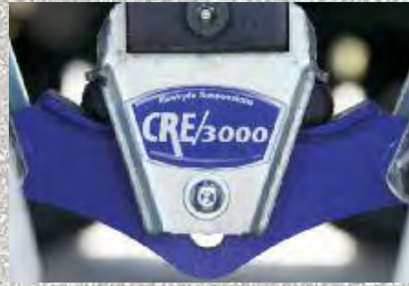
MORryde CRE 3000 Suspension Enhancement System