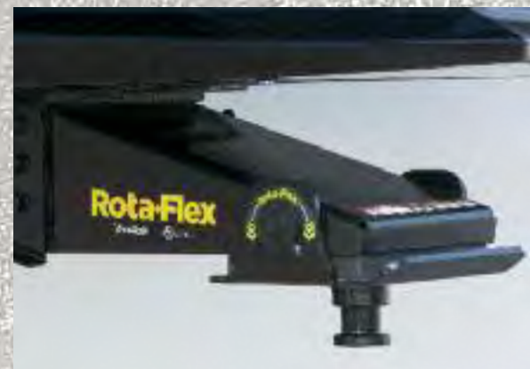
Rota-Flex Pin Box Upgrade