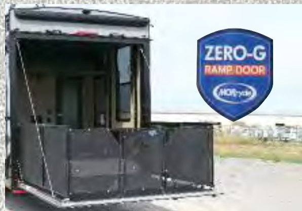
MORryde Zero G Ramp Door and VIP Party Deck with Rear Electric Awning