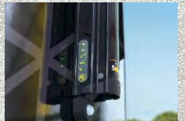
Electric Awning with LED Lights