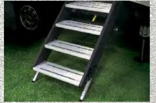
Upgraded Quad Main Entry Steps