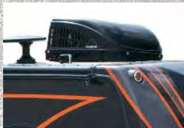
15,000 BTU Ducted Roof A/C