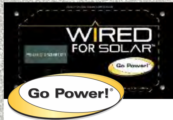
Solar Roof Prep