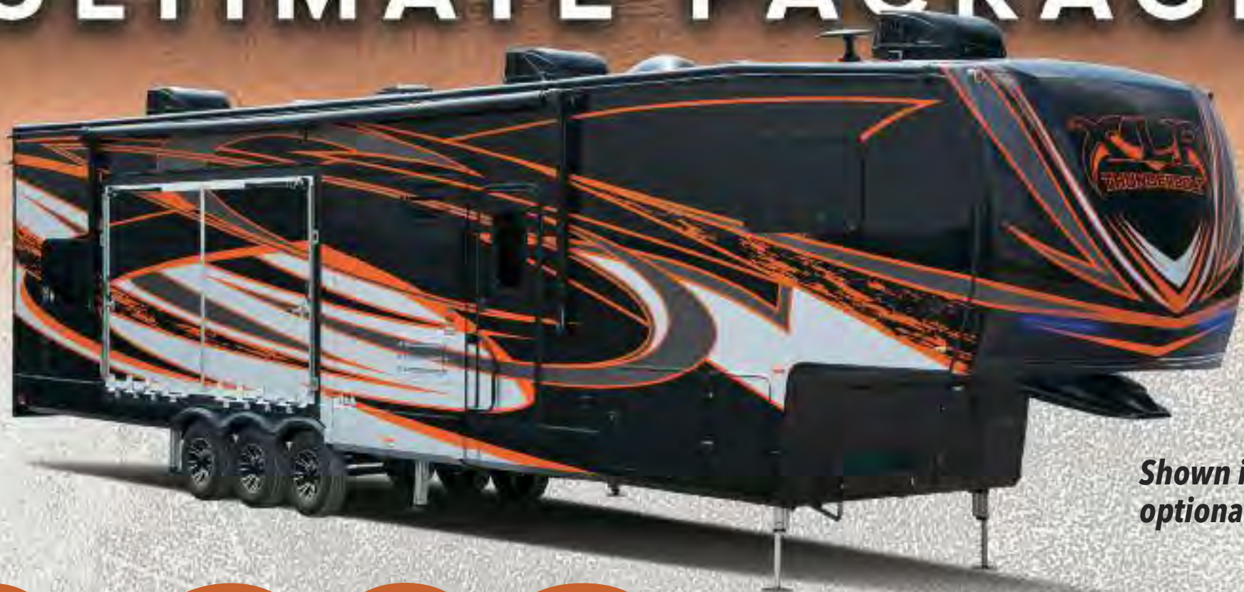
Shown in HD Orange optional full body paint

UP TO $20,293 RETAIL VALUE OF FREE UPGRADES!