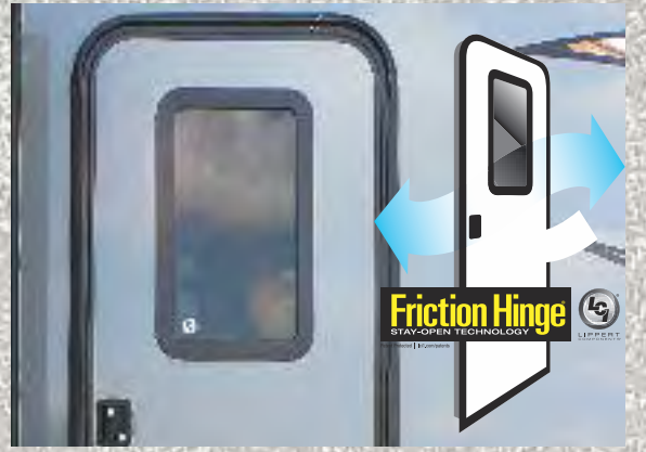
Main Entry Door with Friction Hinge