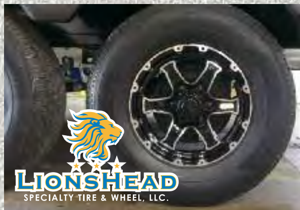
Aluminum Wheels, Radial Tires with Nitrofill and No Fuss Warranty, Full Sized Spare Tire