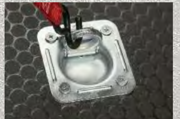
5,000 Lb. Rated Cargo D-rings

Not all models in dealer inventory will be equipped with this package. See dealer for details.