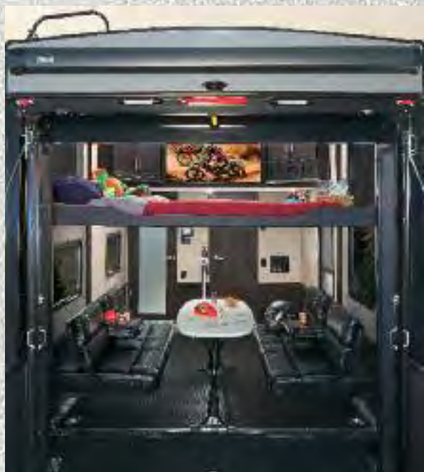
Single Electric Bed with Max Clearance Pass Thru Dinette