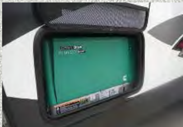
5.5kW Onan Generator

UP TO $20,293 RETAIL VALUE OF FREE UPGRADES!