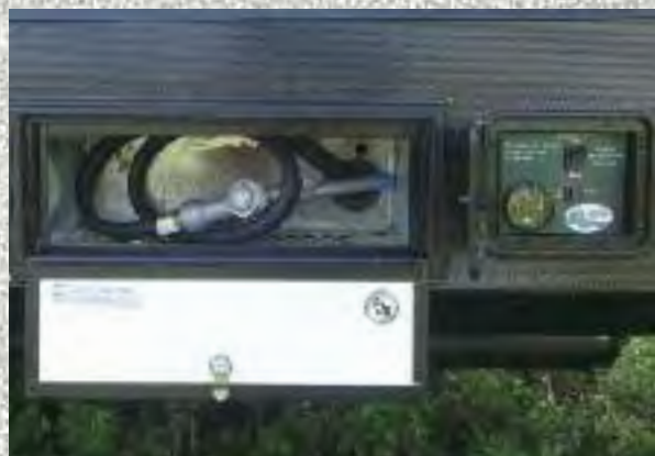
Mobile Fuel Station