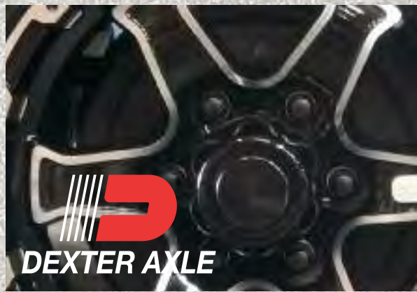
E-Z Lube ® and Nev-R-Adjust ® Axles