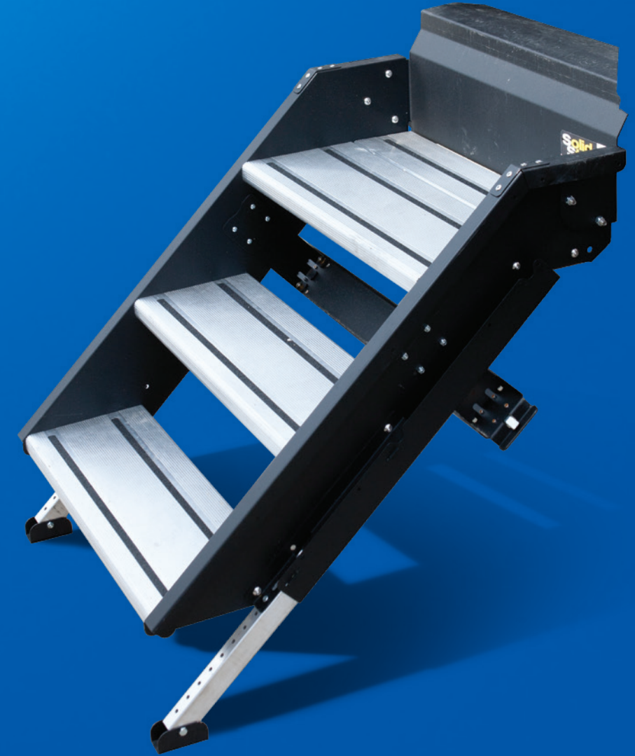
SolidStep® Entry Step