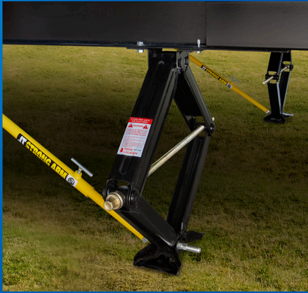
JT Strong Arms