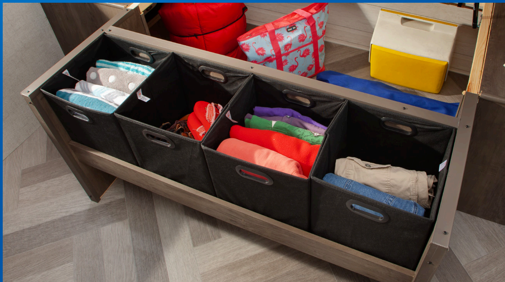
Removable Storage Containers Under Bed