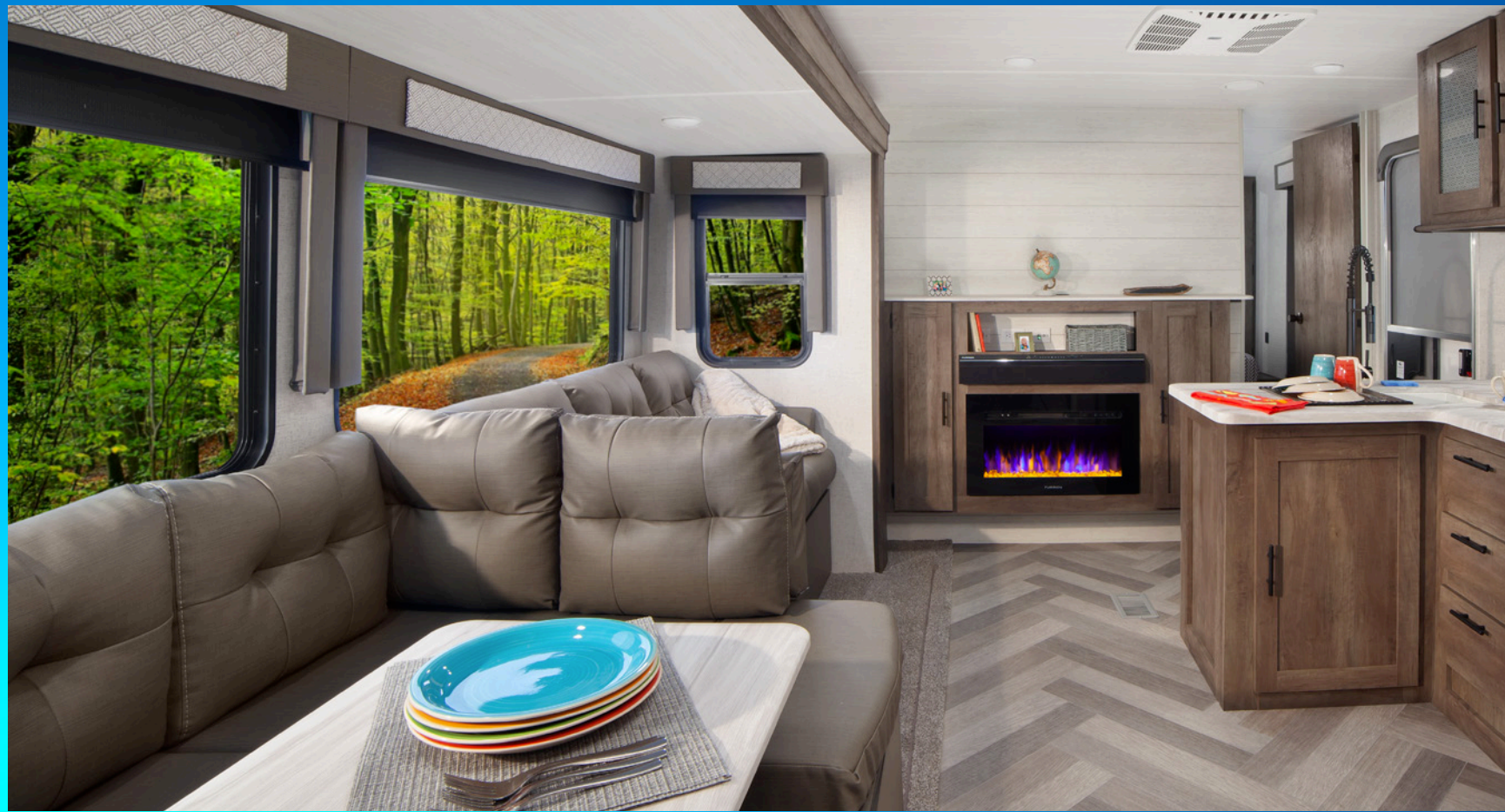
Largest Windows in Class