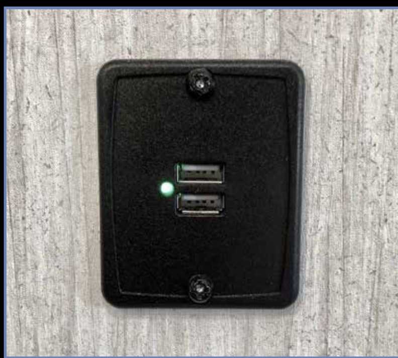
Dual Port USB Charging Stations (Multiple Locations in Living, Kitchen, Bed and Bunk Area)