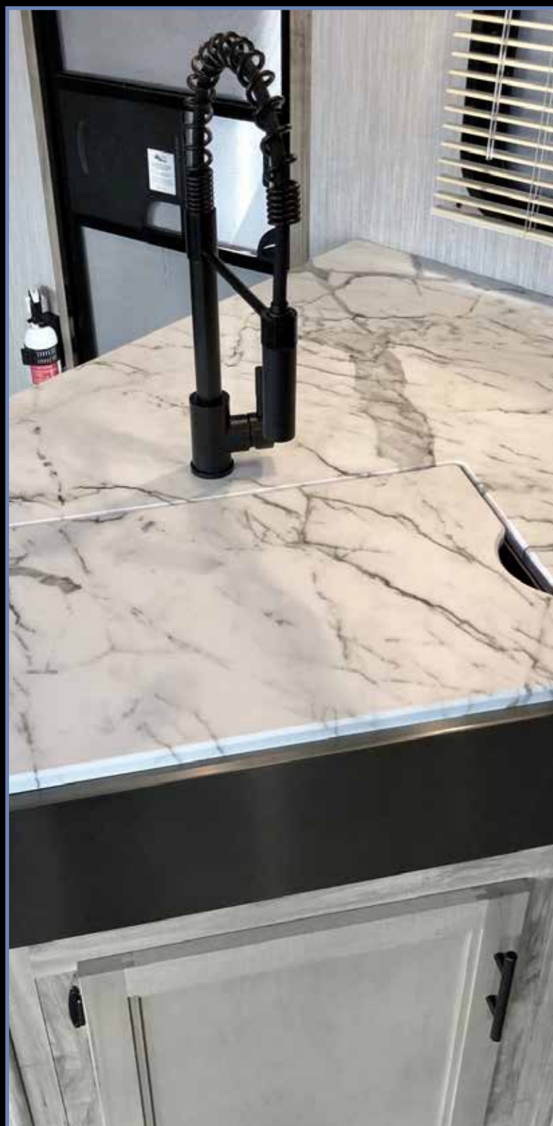
Residential, Oversized Farm Style Kitchen Sink with Flush Mount Cover