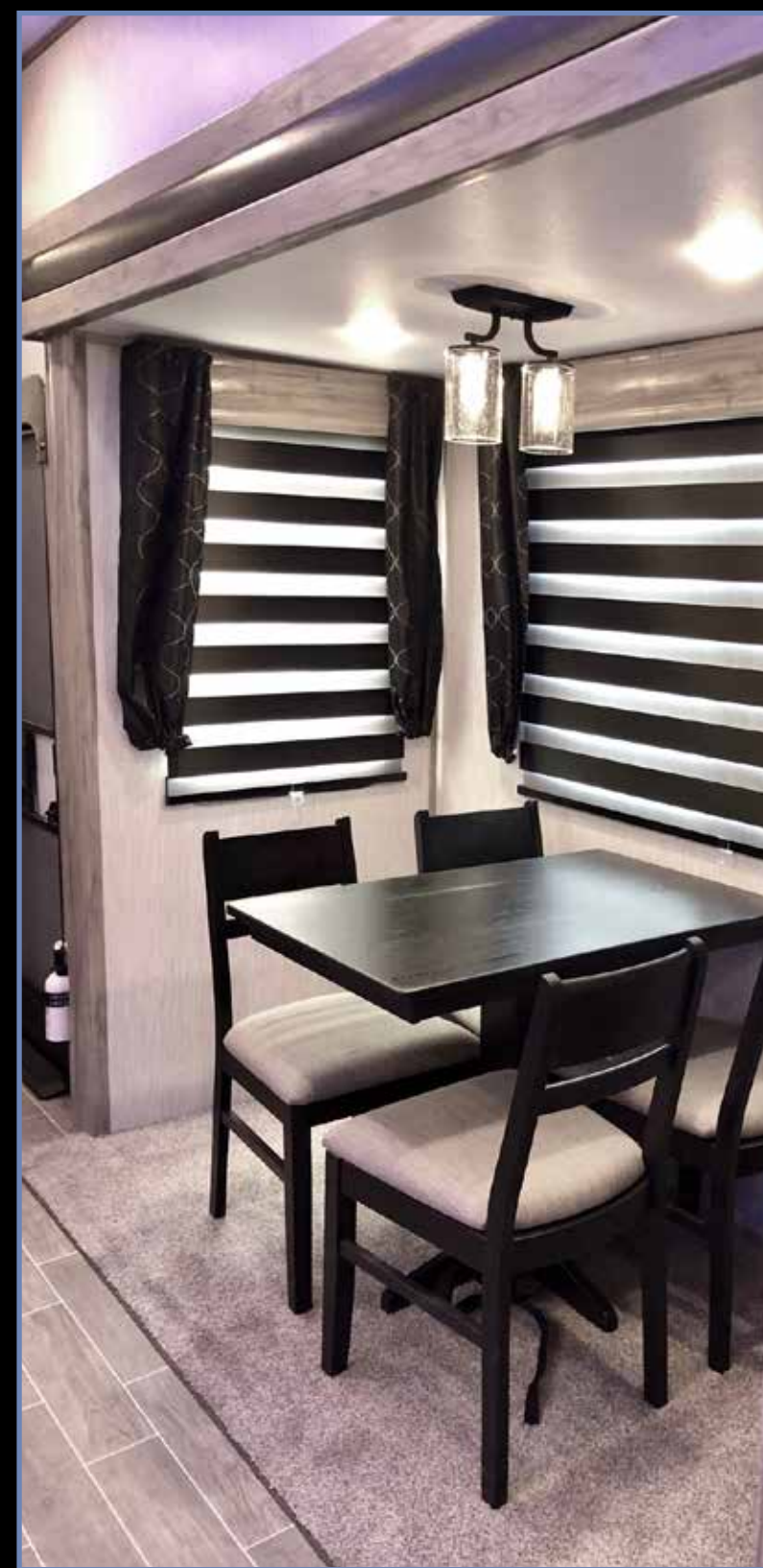
6'4" Slide Room Height (Main Level Floor Slides) with Oversized Panoramic Windows