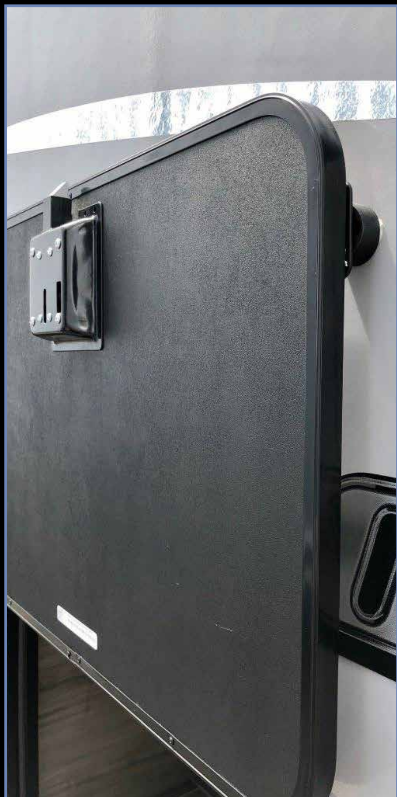
Slam Latch Compartment Doors with "Safety Stay" Magnet Technology