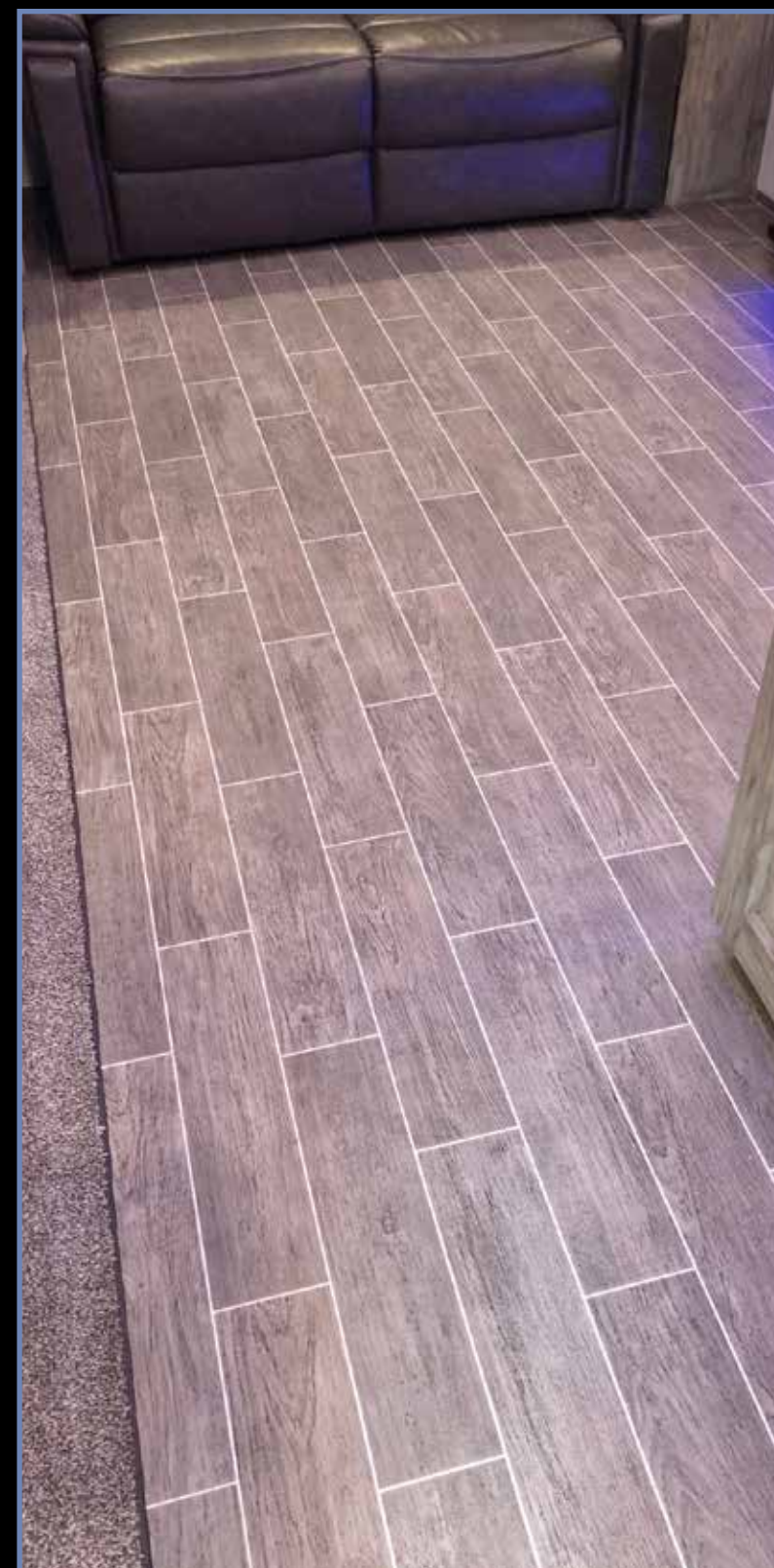
"Clean Sweep" Floor Design (No Heat Vents Cut in Floor)