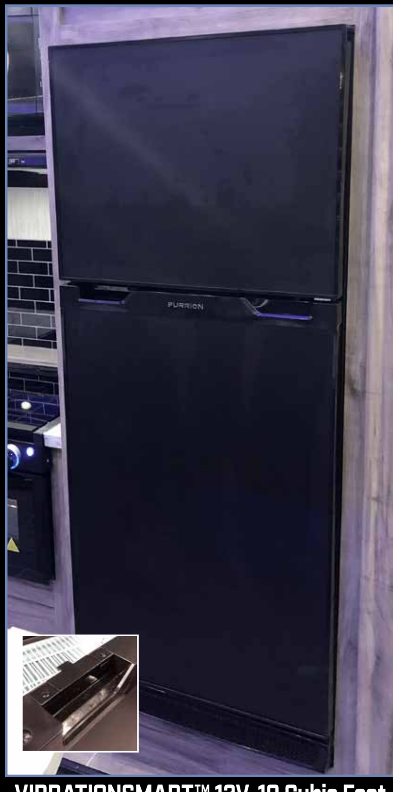
VIBRATIONSMART™ 12V, 10 Cubic Foot Residential Refrigerator with Travel Lock