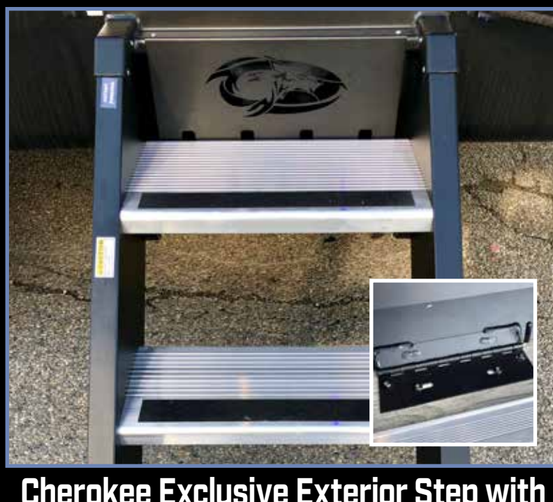
Cherokee Exclusive Exterior Step with Oversized Landing, Quick Release and Protective Kick Plate