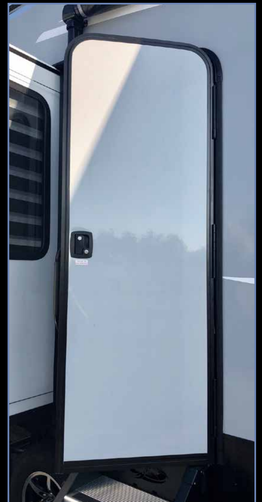
Safety Slam Friction Hinge Entry Door