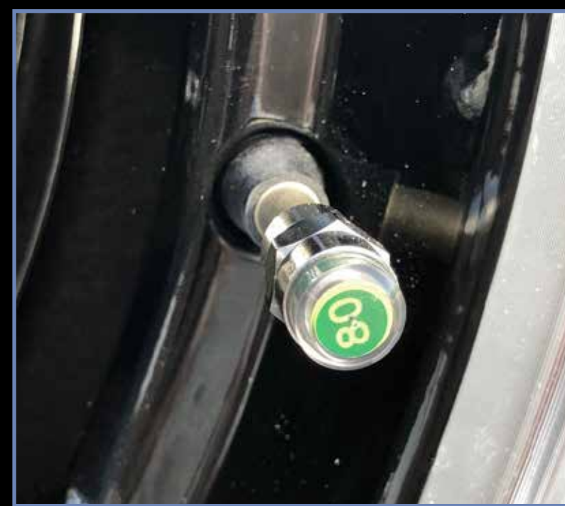
Tire Pressure Safety Sensors.