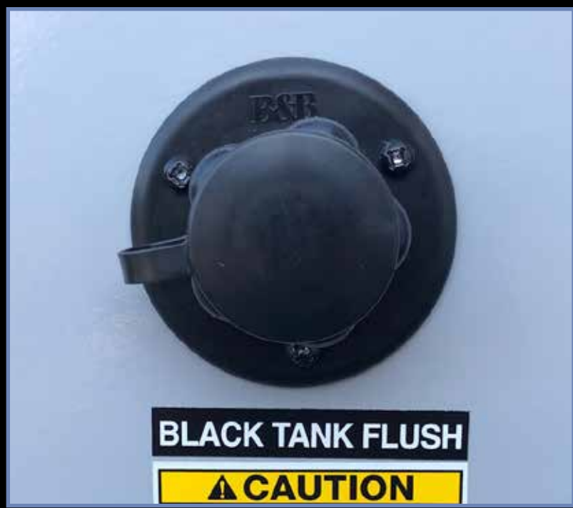
Quick Clean Waste Tank Sprayer