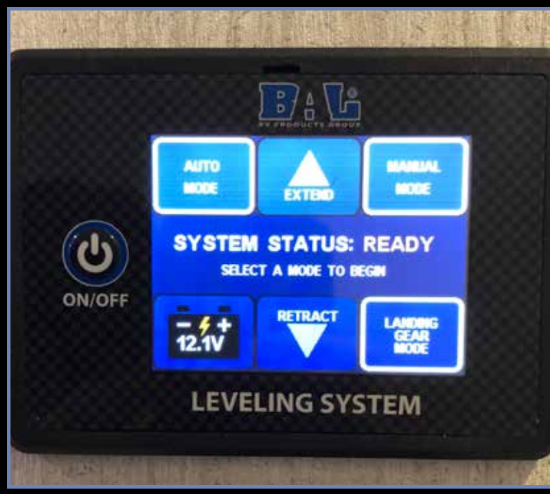
Automatic Leveling System with 18,000 lb. Capacity and Hitch Memory