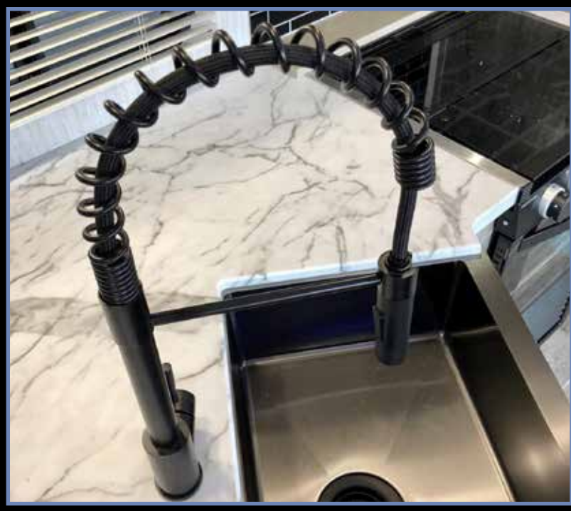
Commercial Grade Spring Spout Kitchen Faucet with Pull-out Sprayer