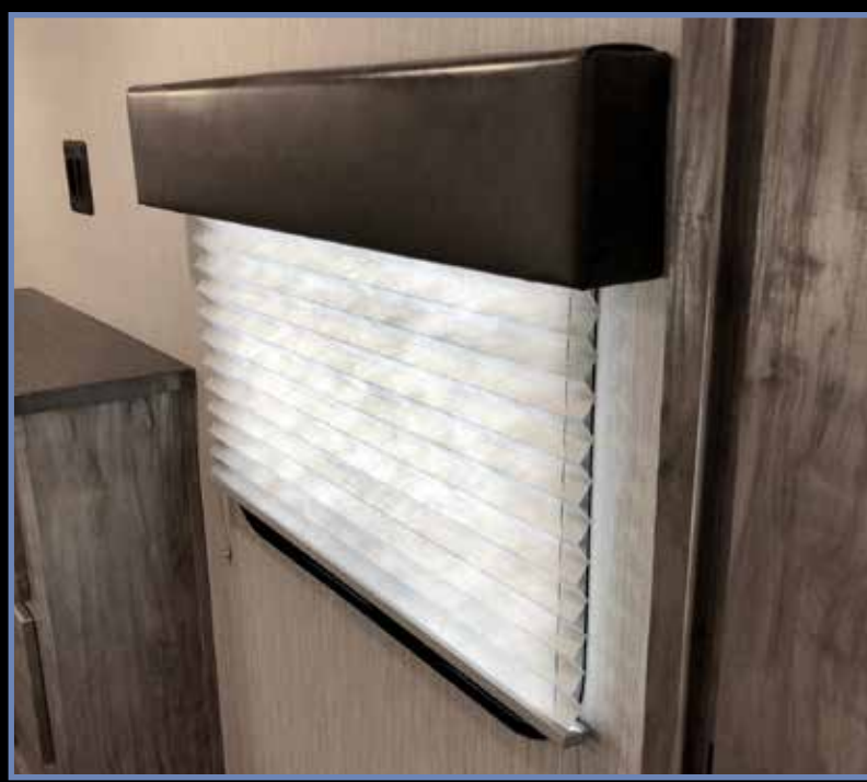
Pleated Shades in Bedrooms, Hallways and Bunk Rooms