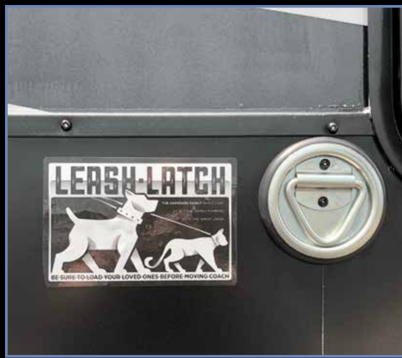
"Leash Latch" Pet Safety Technology