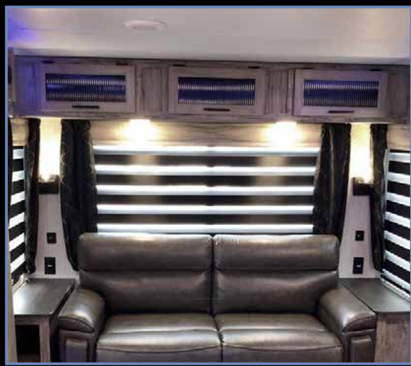
"Zebra Shades" In Main Living Area (Light Filtering with Blackout Capability)