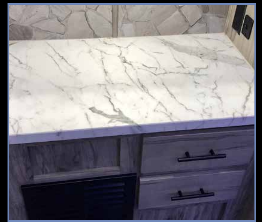
Seamless Counter Tops Throughout