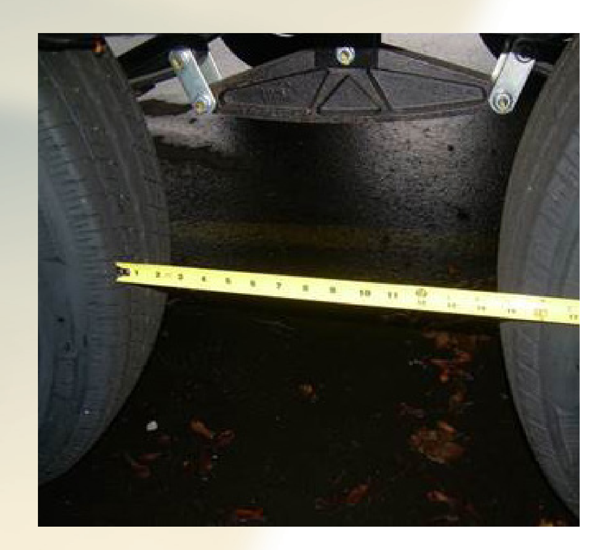
Wide-track spaced axles provide better stability and handling while towing