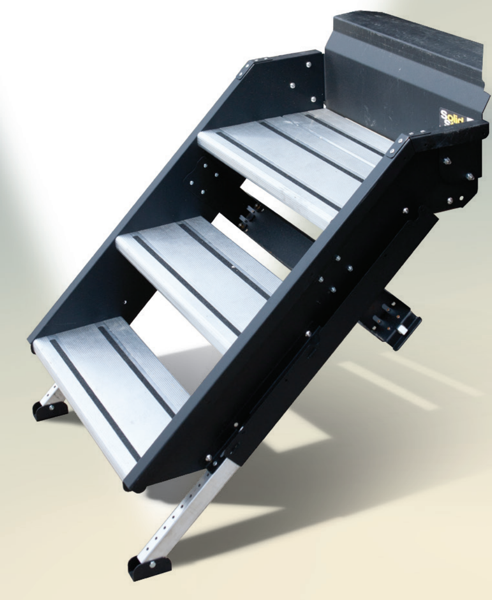
SolidStep® Entry Step