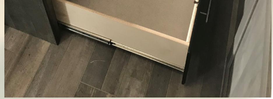
32 inch Deep Pot & Pan drawers, maximizing quick & easy access

Vibe Kitchens provide flush sink covers & flip-up counters to maximize usable countertop space.