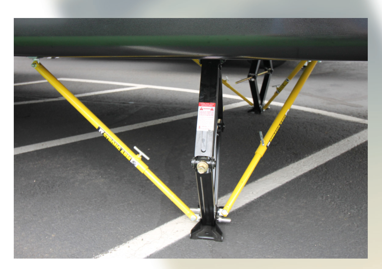
JT Strong Arm Stabilizer Jacks utilize 3 Point Stability instead of one point; Removes almost all swaying and movement of trailer when set