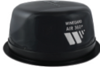
WINEGARD 360+ ANTENNA HDTV and AM/FM antenna with WIFI and LTE controller. Have the capability to work remotely, stay connected, and enjoy more channels.