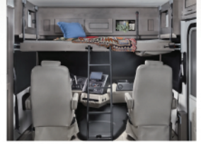
P2K BUNK SYSTEM Electric euro bunk system to rest your head on with a smooth/quiet up and down movement.