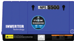
FOREST RIVER EXCLUSIVE NPS YAMAHA GENERATOR 50 AMP service with 5,500KW NPS Yamaha Generator; built-in Pure Sine inverter technology, and manual/keyless start. The cleanest power of any generator on the market.