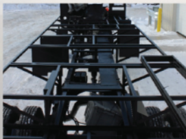
MORryde STEEL CHASSIS UP-FIT Front cockpit steel structure and 1.5" thick tubular steel truss chassis conversion up-fit. Creating a more stable ride and flush floor in cockpit.

Progressive Dynamics converter with patented 4-stage Charge Wizard system has been shown to increase battery life by 2 to 3 times or more.