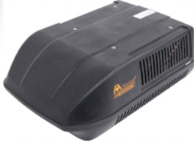
ATWOOD AIR COMMAND OVERSIZED A/C'S (2) High output Quiet Air Command™ ducted roof A/C's with chill construction, dehumidifier & heat pump (not A/C only). More BTUs for more comfort.