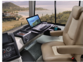
COMPUTER WORK STATION Passenger flip top work station with storage area, drink cup holder and charging station.