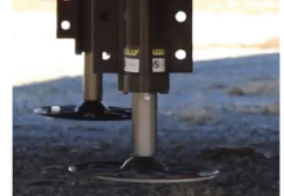
HYDRAULIC JACKS 4pt hydraulic leveling system with auto and manual options. The system will adjust to the grade of the ground keeping your coach level while camping.