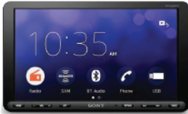
SONY RADIO WITH APPLE CARPLAY & ANDROID AUTO 9.6" screen positioned for the driver to see clear with: Apple Carplay, Android Auto, camera viewing (rear/side), AM/FM radio, bluetooth audio. Conveniently positioned towards the driver's seat and simple to use at a quick glance.