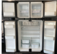
12 CU. FT. FOUR DOOR GAS & ELECTRIC REFRIGERATOR The refrigerator for all purposes. Great when plugged in, driving down the road, or boondocking. You will not have to worry about draining batteries and having less storage.

Heated and enclosed compartments wrapped in thermal insulation with forced air from the furnace as well as electronic heat pads on the holding tanks and gate valves.