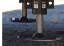
HYDRAULIC JACKS 4pt hydraulic leveling system with auto and manual options. The system will adjust to the grade of the ground keeping your coach level while camping.