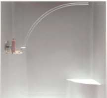
MOLDED FIBERGLASS SHOWER Molded one piece fiberglass shower structure with no seams.