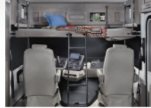
P2K BUNK SYSTEM Electric euro bunk system to rest your head on with a smooth/quiet up and down movement.