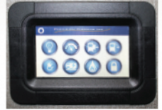
PRECISION CIRCUITS Low voltage electronic systems control for HVAC, slide, awning, water pump; shows tank levels and generator with Auto Gen Start. Accessible by smart phone or tablet, onboard touchpad or the manual diagnostics panel.