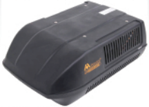
ATWOOD AIR COMMAND OVERSIZED A/C'S 2 High output Quiet Air Command™ ducted roof A/C's with chill construction, dehumidifier & heat pump pure Arc only. More BTUs for more comfort.