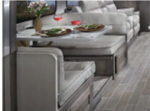
DREAM DINETTE Extra large cushion seating with solid surface table allowing easy in and out access that converts into sleeping area.