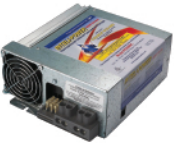
CHARGE WIZARD Progressive Dynamics converter with patented 4-stage Charge Wizard system has been shown to increase battery life by 2 to 3 times or more.