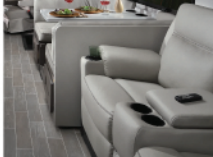
POWER THEATER SEATING Luxury power reclining theater seats with heat, massage, 110 USB, indirect LED lighting, detachable tray and adjustable headrests.