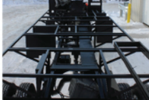
MORryde STEEL CHASSIS UP-FIT Front cockpit steel structure and 1.5" thick tubular steel truss chassis conversion up-fit. Creating a more stable ride and flush floor in cockpit.