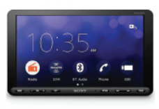
SONY RADIO WITH APPLE CARPLAY & ANDROID AUTO 9.6" screen positioned for the driver to see clear with: Apple Carplay, Android Auto, camera viewing (rear/side), AM/FM radio, bluetooth audio. Conveniently positioned towards the driver's seat and simple to use at a quick glance.