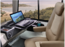
COMPUTER WORK STATION Passenger flip top work station with storage area, drink cup holder and charging station.