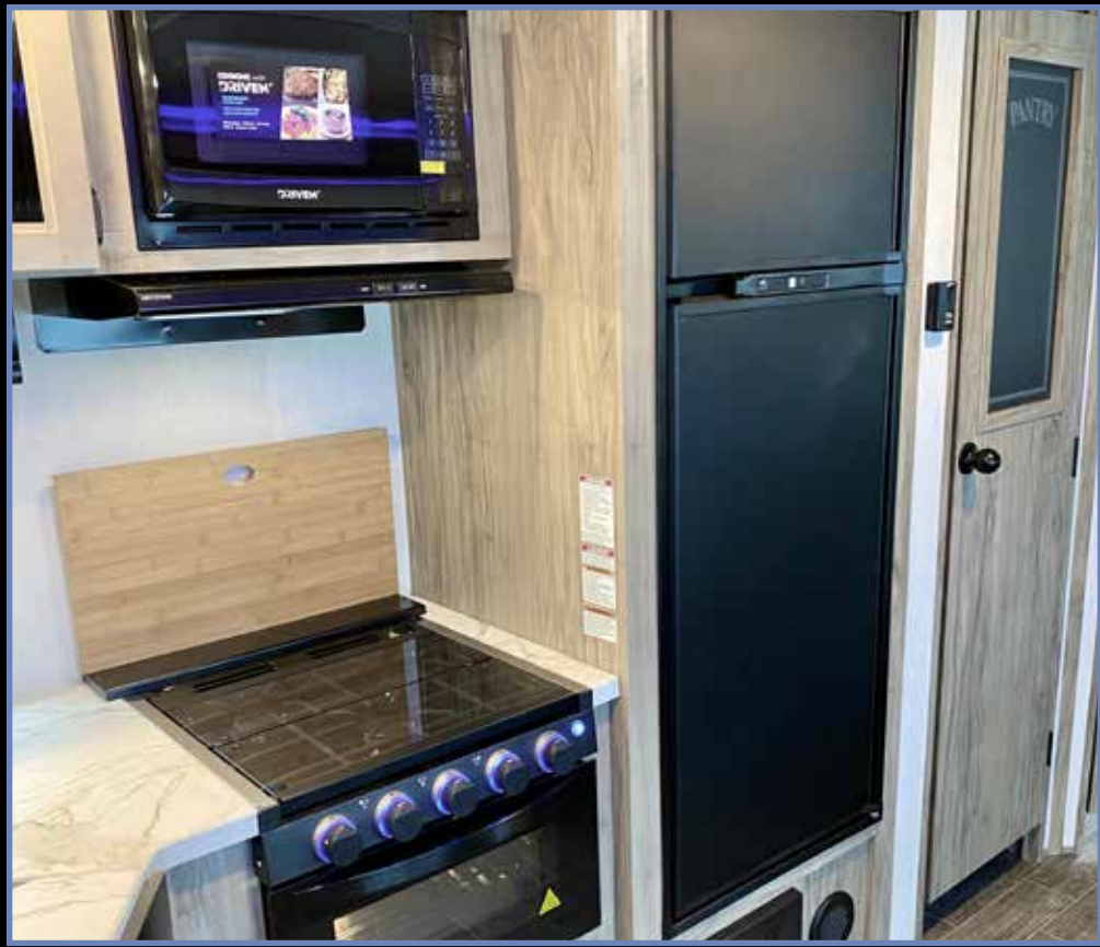
"Blackout" Kitchen Appliance and Hardware Package