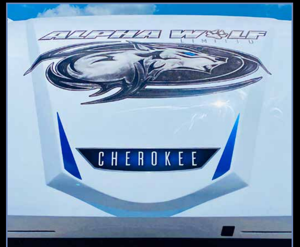
High Gloss Gel Coated Front Cap