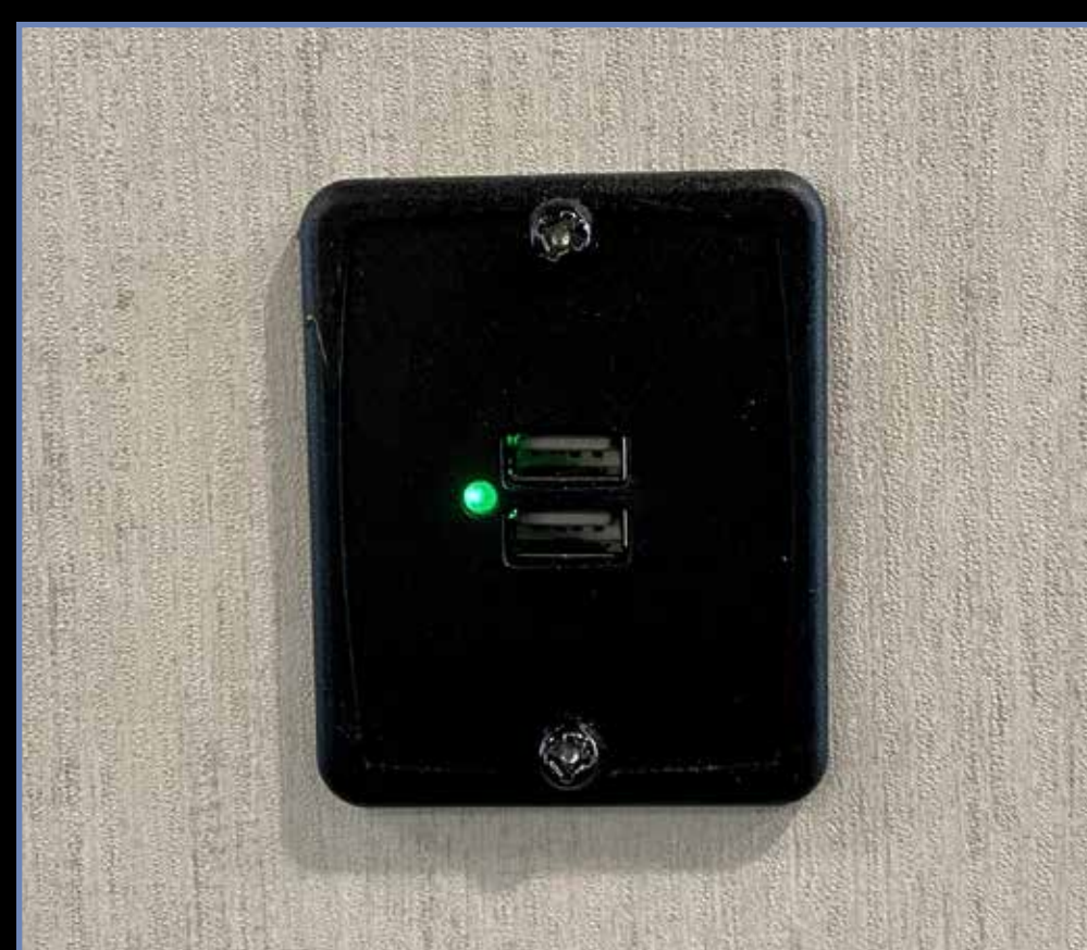
Dual Port USB Charging Stations (Multiple Locations in Living, Kitchen, Bed and Bunk Area)