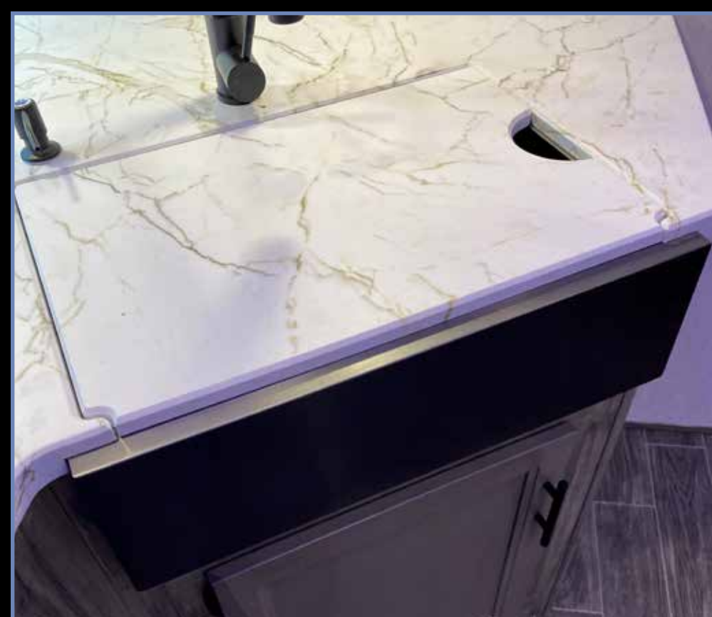
Residential, Oversized Farm Style Kitchen Sink with Flush Mount Cover