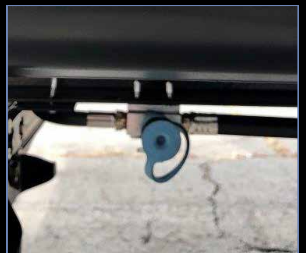
LP Quick Connect for Optional Bumper Mounted Swing Arm Grill