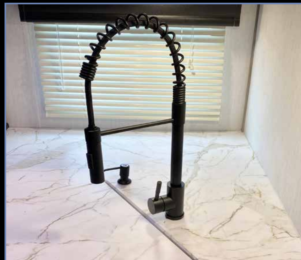
Commercial Grade Spring Spout Kitchen Faucet with Pull-out Sprayer