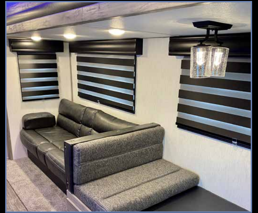
"Zebra Shades" In Main Living Area (Light Filtering with Blackout Capability)