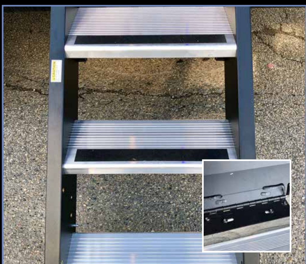
Cherokee Exclusive Exterior Step[s] with Oversized Landing, 600LB. Capacity, Quick Release and Kick Plate