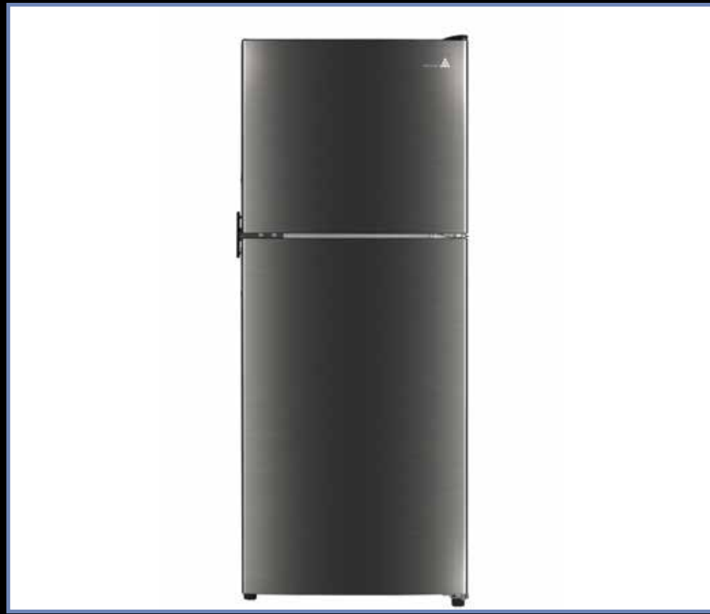
Cannon™ 12V, High Efficiency, 11 Cubic Foot Residential Refrigerator with Travel Lock