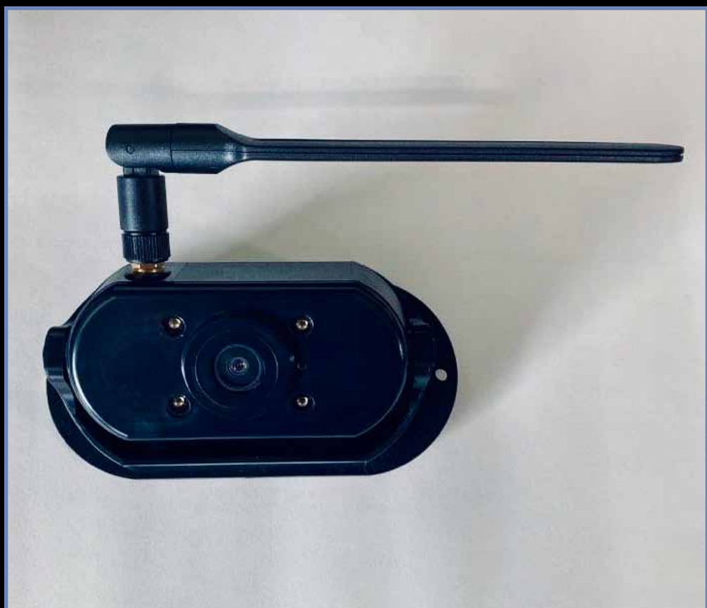
Rear Observation Camera with Bluetooth Connectivity and Operation