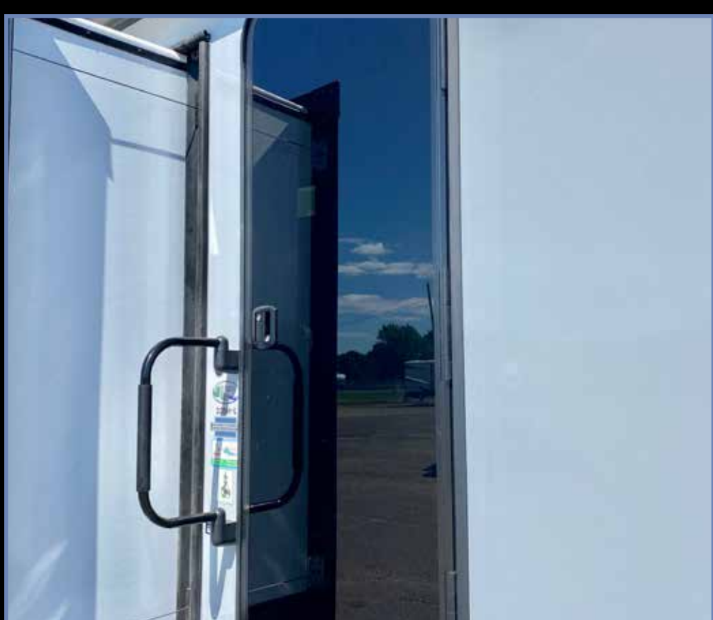
100% Safety Glass Entry Door with Dark Tint, Friction Hinge, Viewing Window and Shade Prep