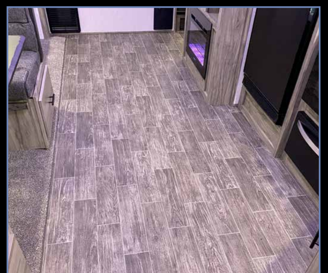
"Clean Sweep" Floor Design (No Heat Vents)