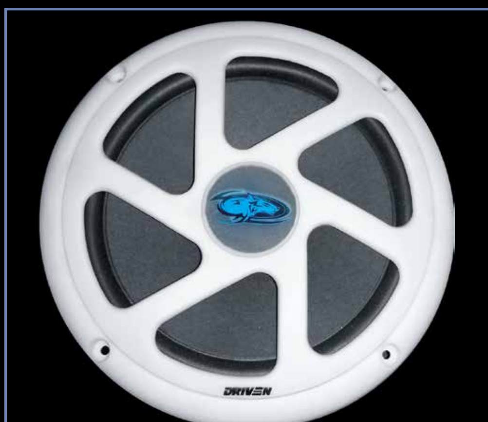
8" Ceiling Mounted, 200W Subwoofer with Accent Lighting