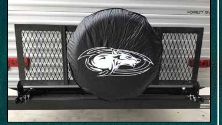
Flip Down Travel Rack