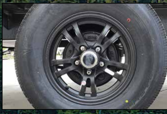
Premium Wheel Package