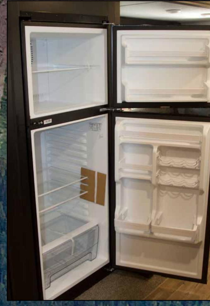
Cannon™ 12V, High Efficiency, 11 Cubic Foot Residential Refrigerator with Travel Lock