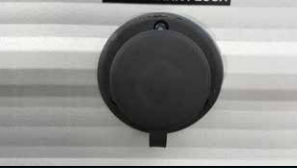
Black Waste Tank Flush out Kit