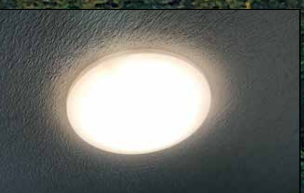
LED Interior Lights