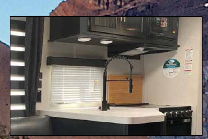
Chef Select Black Stainless Steel Kitchen Suite Package