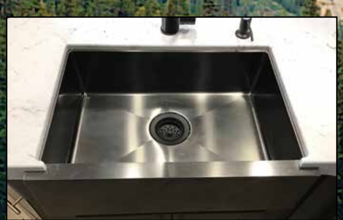
Residential Farm Style Black Stainless Steel Sink