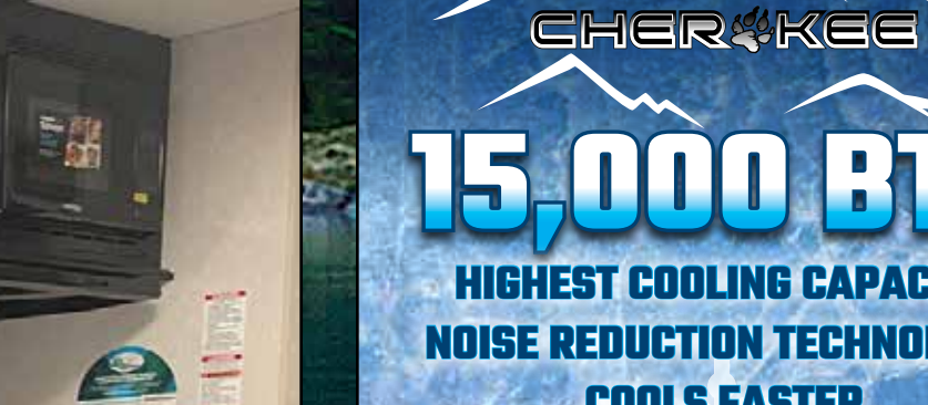
Supersized, Central Air Conditioning Unit