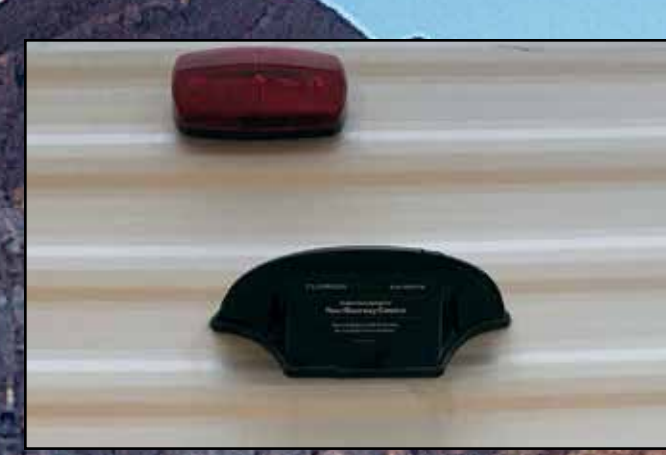
Cherokee Back up Camera System