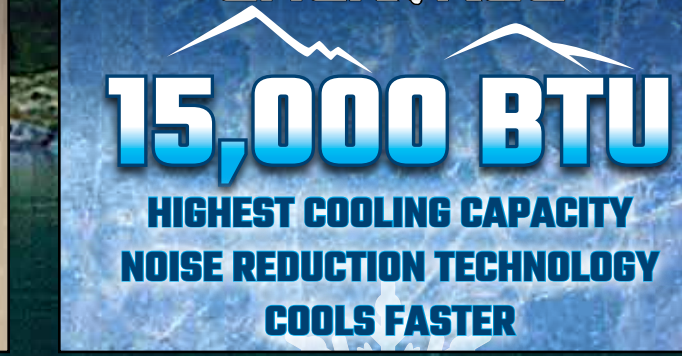
(15,000 BTU) with Quick Cool Air Dump Feature