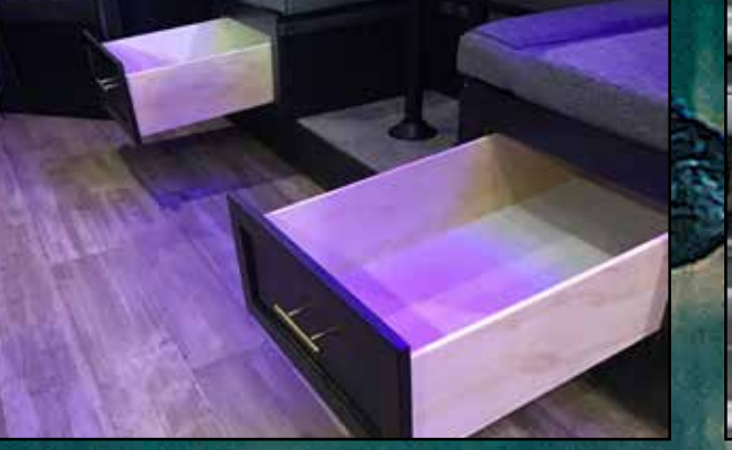
40" Dinette Drawers x 2 on models with slideouts