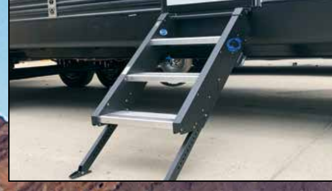
Cherokee Exclusive Stable Step with Oversized Landing, 600LB. Capacity, Quick Release and Kick Plate