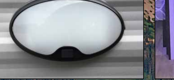
External Porch Scare Light