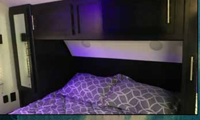
Cabinets in Bedroom