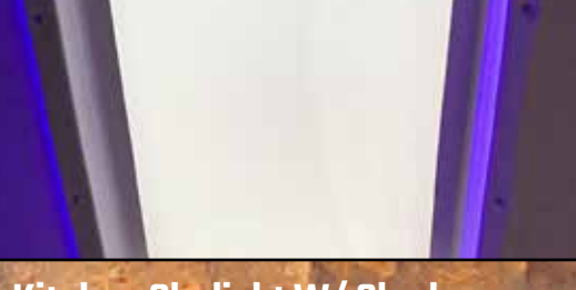
Kitchen Skylight W/ Shade