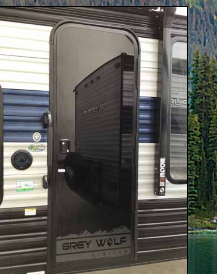
Real Blackout Glass, Safety Slam, Friction Hinge Entry Door with Window and Shade Prep