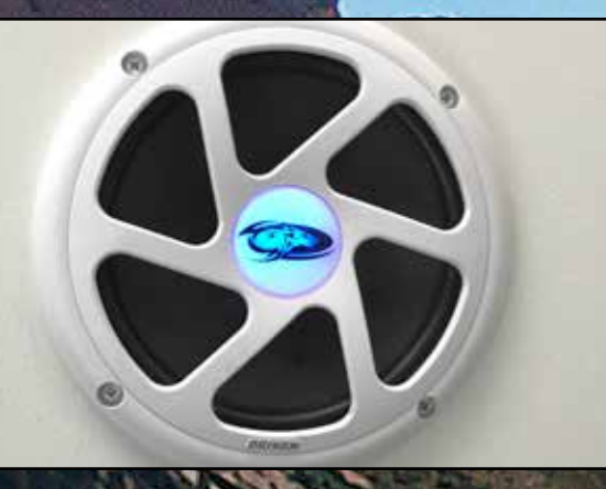
8" Ceiling Mounted, 200W Subwoofer with Accent Lighting