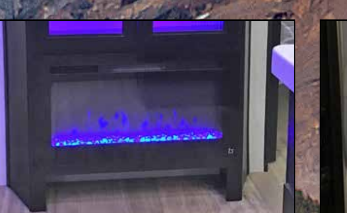
Fireplace (not available on all models) Full Hybrid Tub with Shower Surround