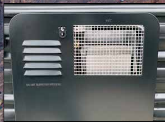
6 Gallon Gas/Elec DSI Water Heater