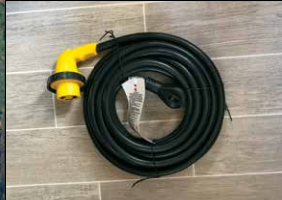
Detachable Power Cord