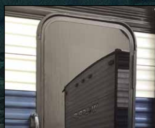
Large Exterior Folding Assist Handle