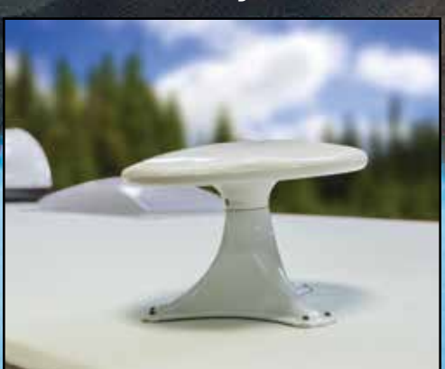
TV Antenna with Hookups