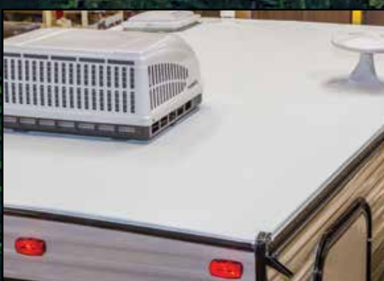
Seamless Roofing Membrane with Heat Reflectivity