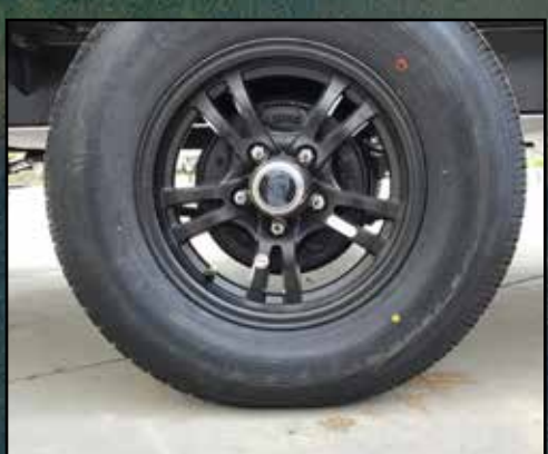
Nitrogen Filled Tires