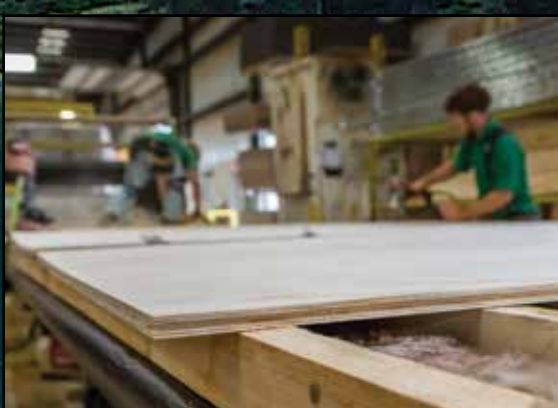
Tongue and Groove Plywood Flooring