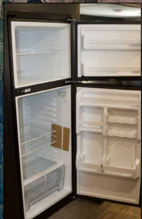
Cannon™ 12V, High Efficiency, 11 Cubic Foot Residential Refrigerator with Travel Lock