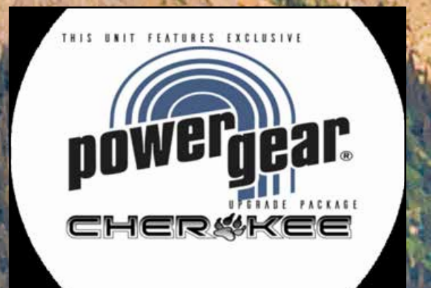
Power Gear™ Frame Technology and Space Saver Rail Design