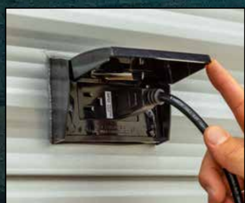
Exterior 110V Recept