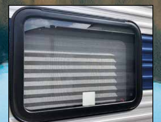
Safety Glass Windows