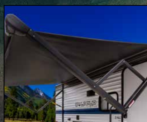
Full Length Awning