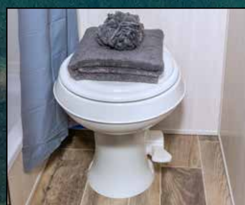
Foot Flush Toilet