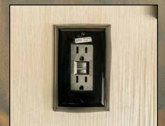
GFI Protective Outlet