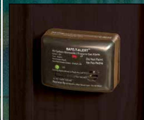
Carbon Monoxide Detector