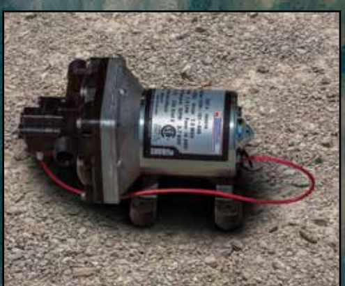
High Flo Water Pump