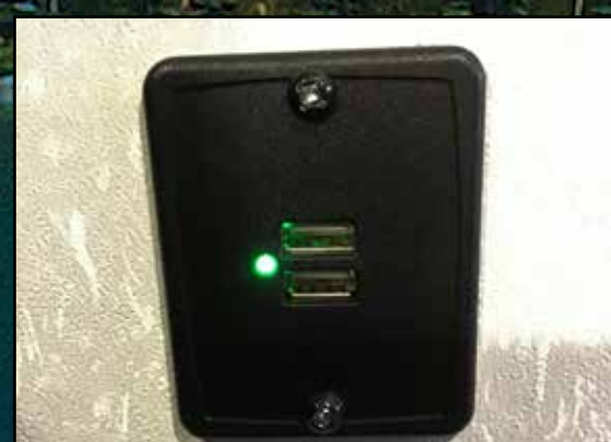
USB charging stations (Beds, Bunks, Table where Applicable)