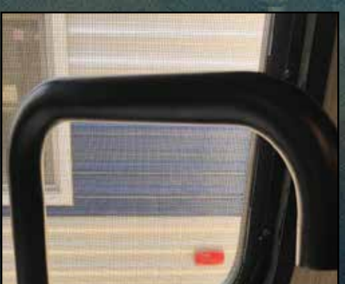
High Rise Faucet