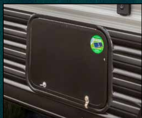
Outside Storage Door