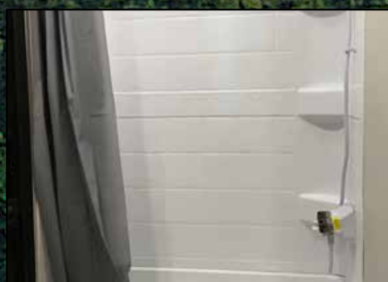
Shower Tub Surround