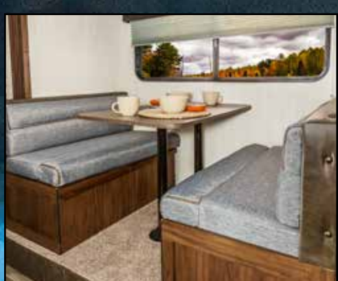
Oversized Dinette with Removable Table