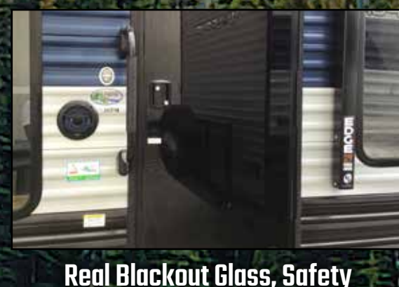
Real Blackout Glass, Safety Slam, Friction Hinge Entry Door with Window and Shade Prep