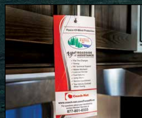
Safe Ride Roadside Assistance