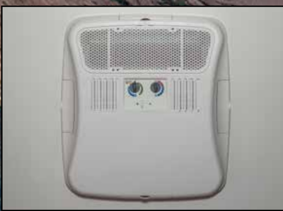
13,500 BTU Air Conditioner