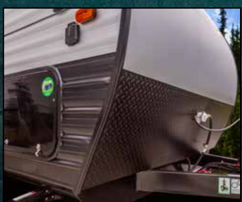
High Impact Front metal IPO corrugated metal