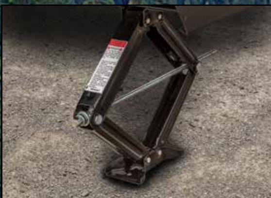
Four Stabilizer Jacks