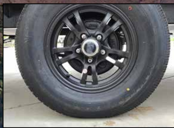
14" Premium Wheel Package