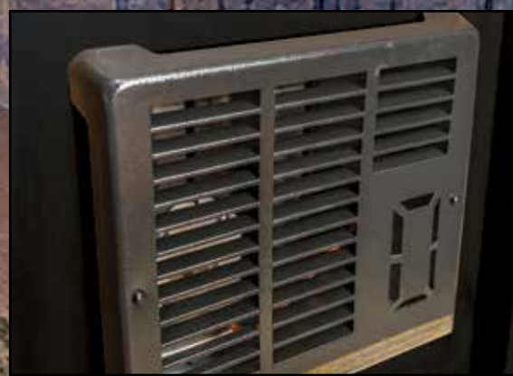
20,000 BTU Furnace