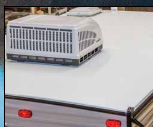
One Piece, Walkable Decked Roof