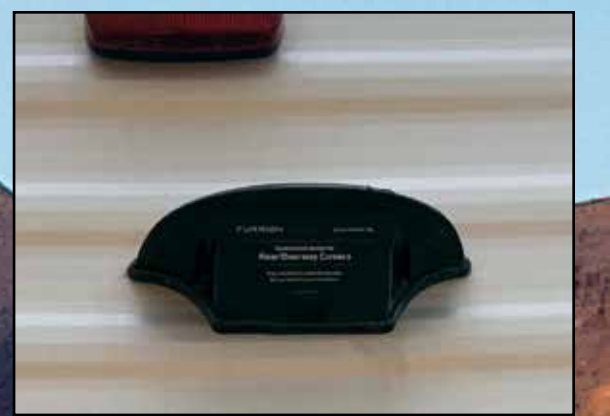
Cherokee Back up Camera System