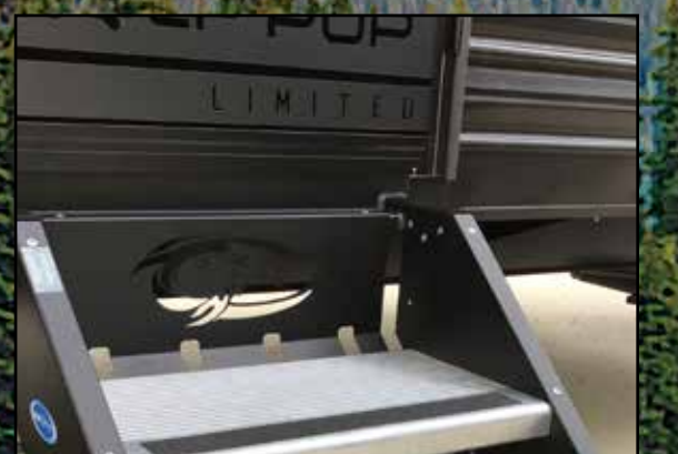
Cherokee Exclusive Stable Step with Oversized Landing, 600LB. Capacity, Quick Release and Kick Plate