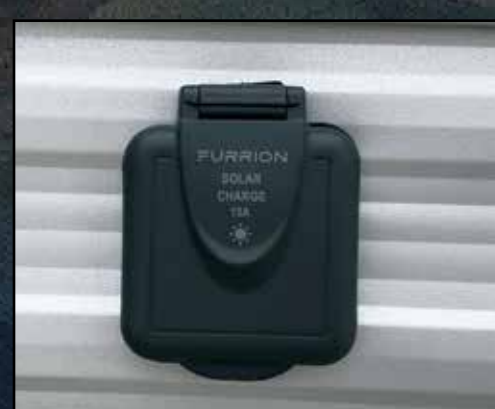
Solar Prep and Wiring