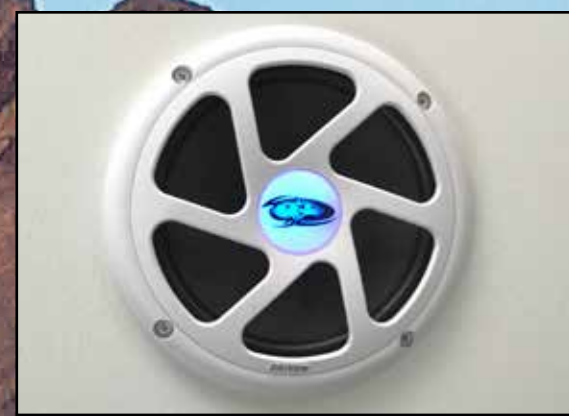
8" Ceiling Mounted, 200W Subwoofer with Accent Lighting