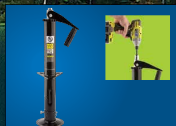
Wolf Pup Quick Jack