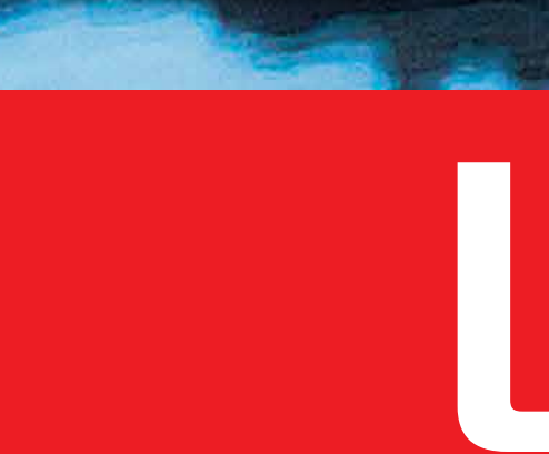
26" Wide Door IPO 22" Door