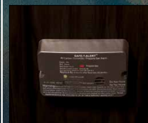
LP Gas Detector