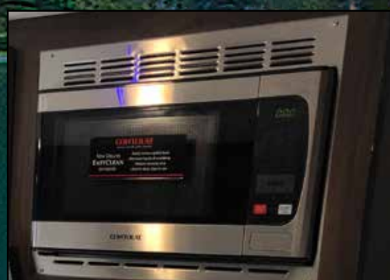
Upgraded Stainless Range Hood with Light and Fan