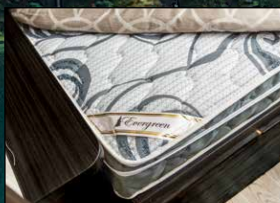
Upgraded Evergreen Mattress