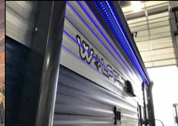
Exterior LED Light Strip at Awning