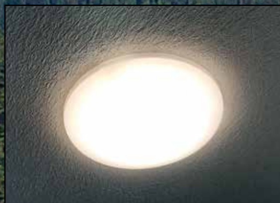
LED Interior Lights