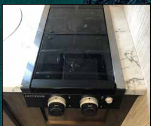
High Output Cooktop