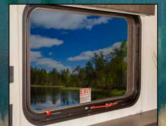
Emergency Exit Windows