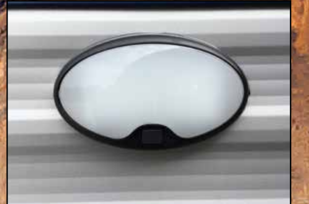
External Porch Score Light