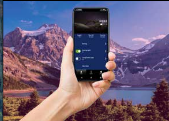
Cherokee Total Control App & Remote Control System