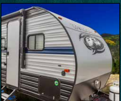
Aerodynamic Smooth Radius Front Profile