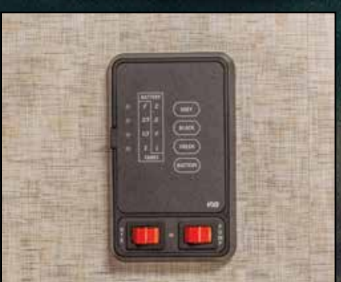
Monitor Panel for Tanks and Battery Levels