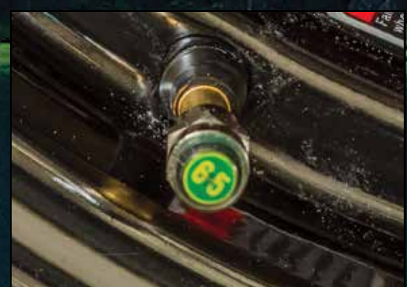
Tire Pressure Monitors