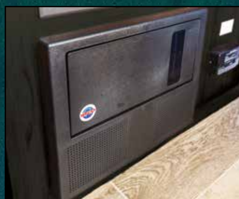
55 Amp Converter