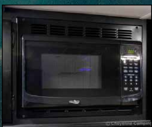
Large High Output Microwave