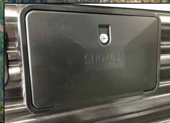
Outside Shower with Hot and Cold Water