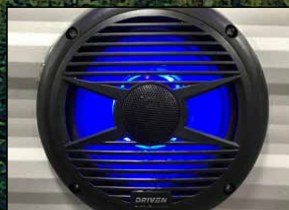
Stereo with Inside and Outside Speakers