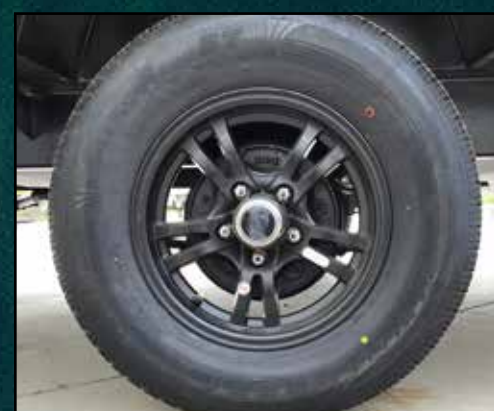
14" Tires for improved towing in place of 13"