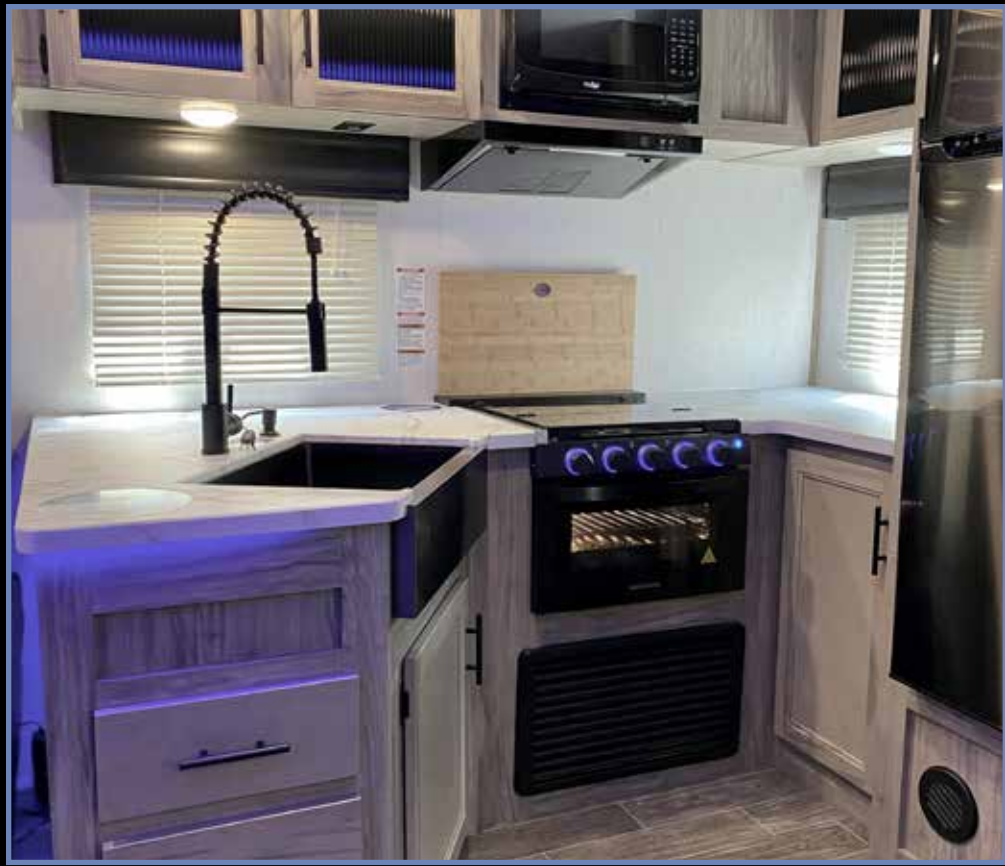
"Blackout" Kitchen Appliance and Hardware Package