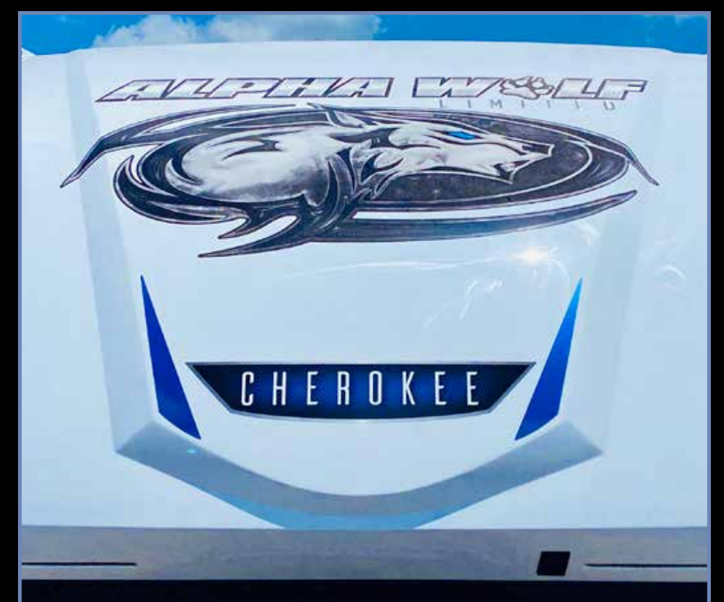
High Gloss Gel Coated Front Cap