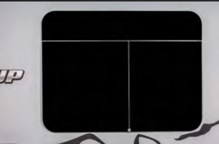
Automotive Frameless Windows Package

The Wolf Pup is proud to offer the Black Label Edition as an optional upgrade to the brand. The Black Label Edition includes all the regular standard Wolf Pup features along these additional highlights shown below.