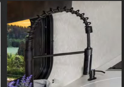
Residential Pullout Faucet