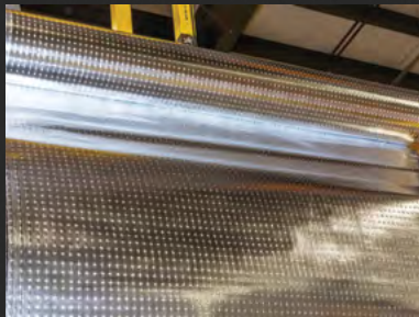
Thermo-Foil Arctic Insulation