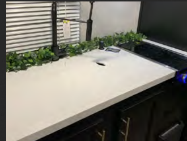
LG Solid Surface Countertop