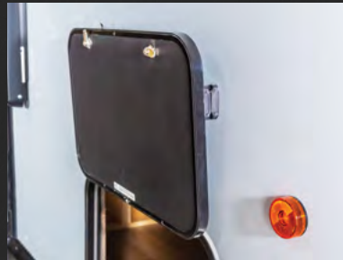
Hands Free Baggage Door Catch