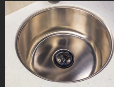
Deep Stainless Steel Sink